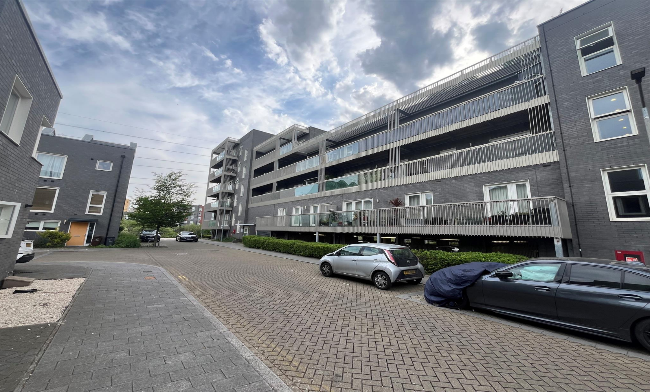
Ernest Websdale House, Harlequin Close, Barking, IG11 0FX