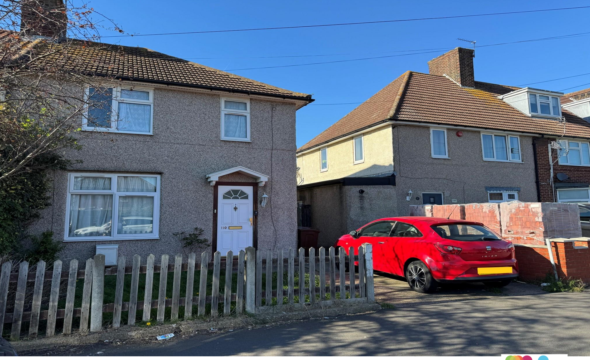
Keppel Road, Dagenham, RM9 5LX