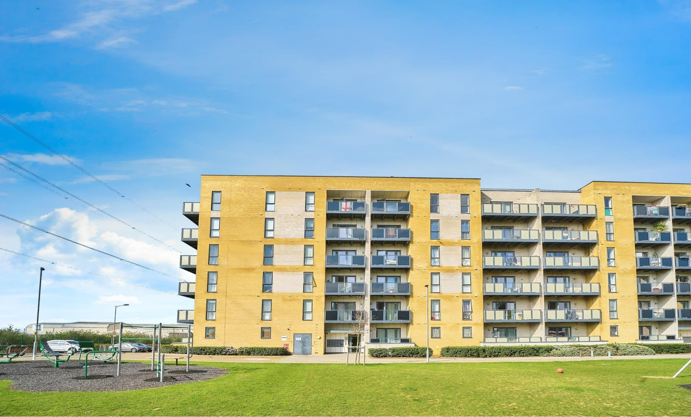
Breacher House, Handley Page Road, Barking, IG11 0UX