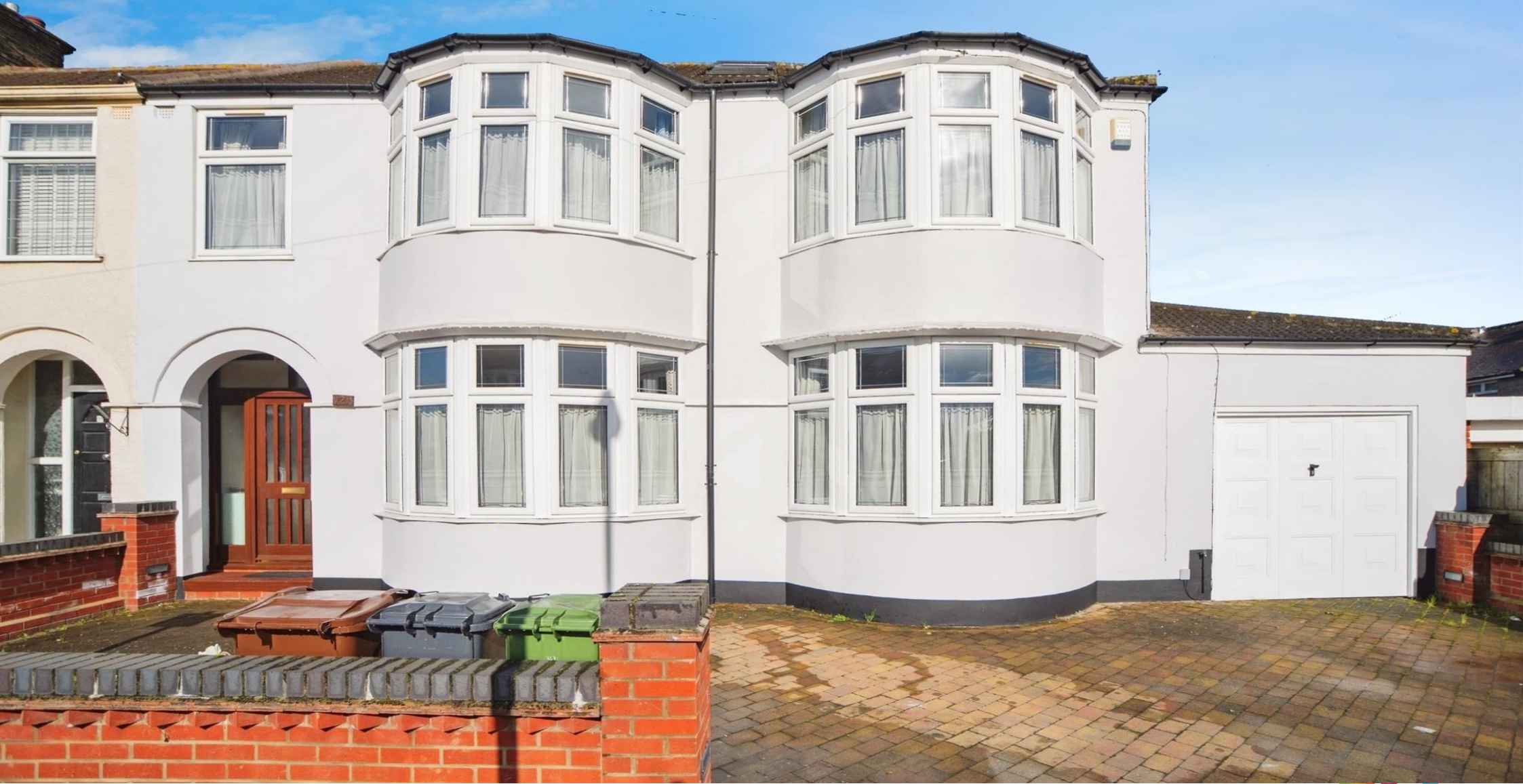
Shirley Gardens, Barking, IG11 9XB