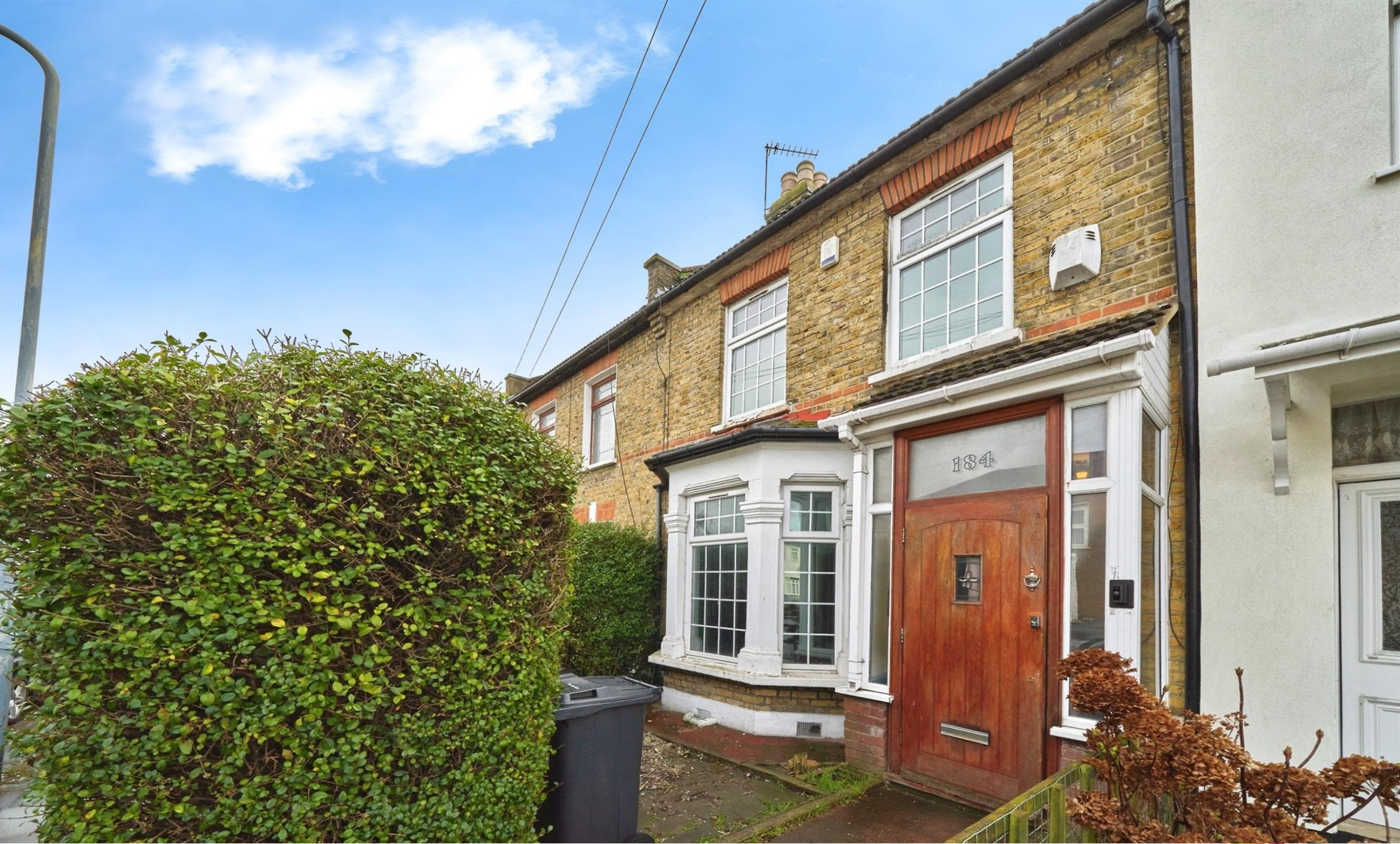
Grange Road, Ilford, IG1 1HB