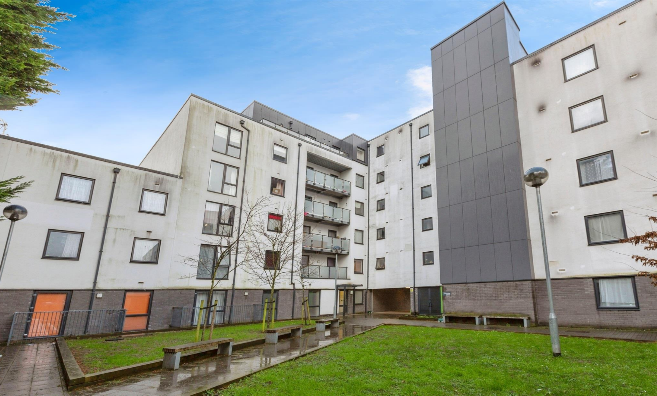
Prioress House, Loxford Road, Barking, IG11 8SD