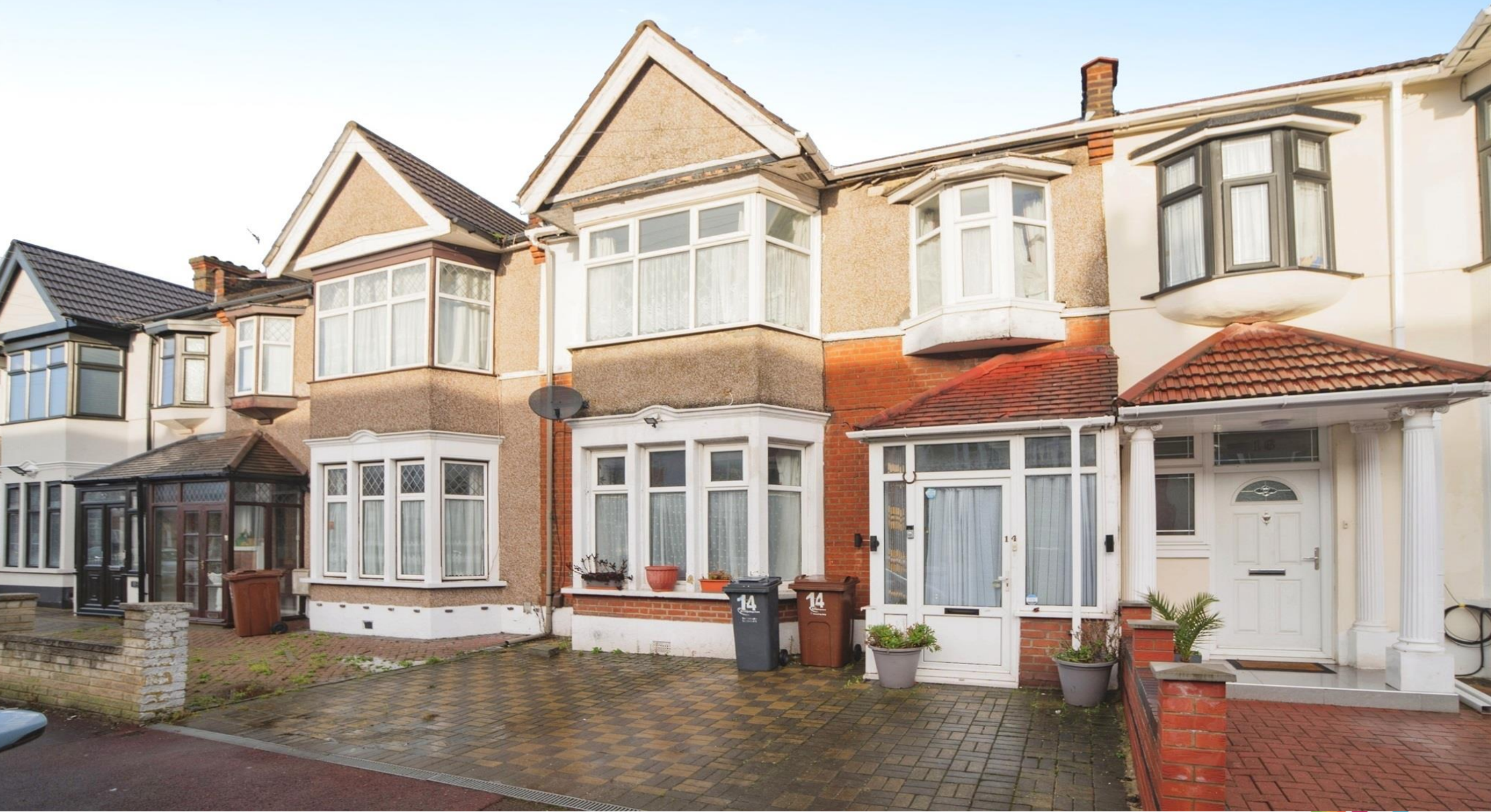
Hurstbourne Gardens, Barking, IG11 9UX