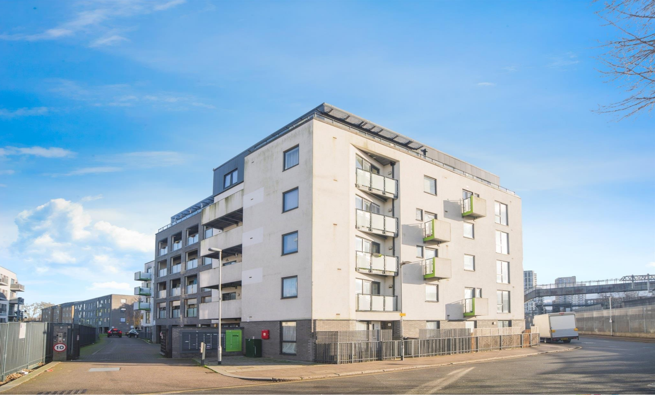
Prioress House, Loxford Road, Barking, IG11 8SD