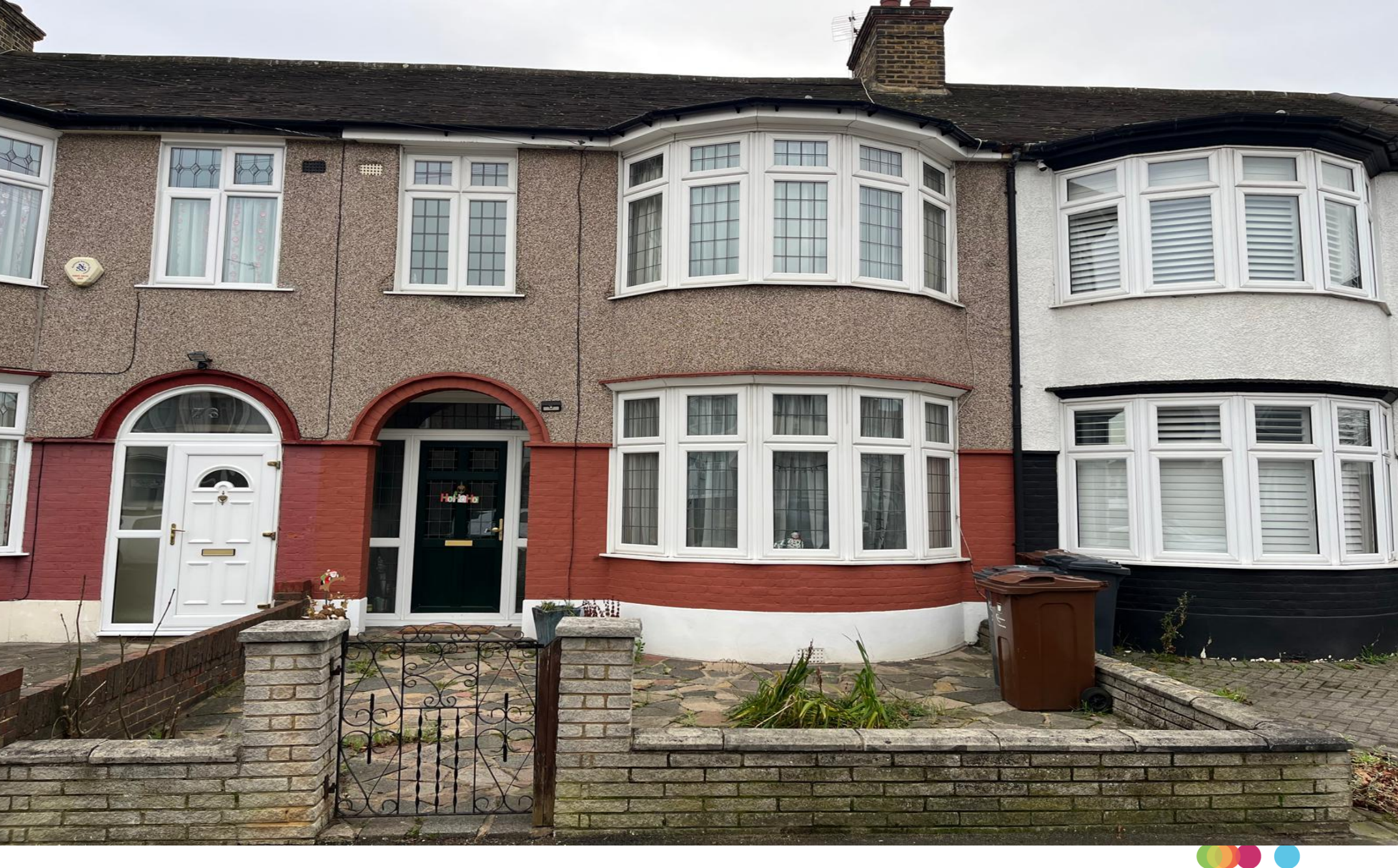
Hulse Avenue, Barking, IG11 9UP