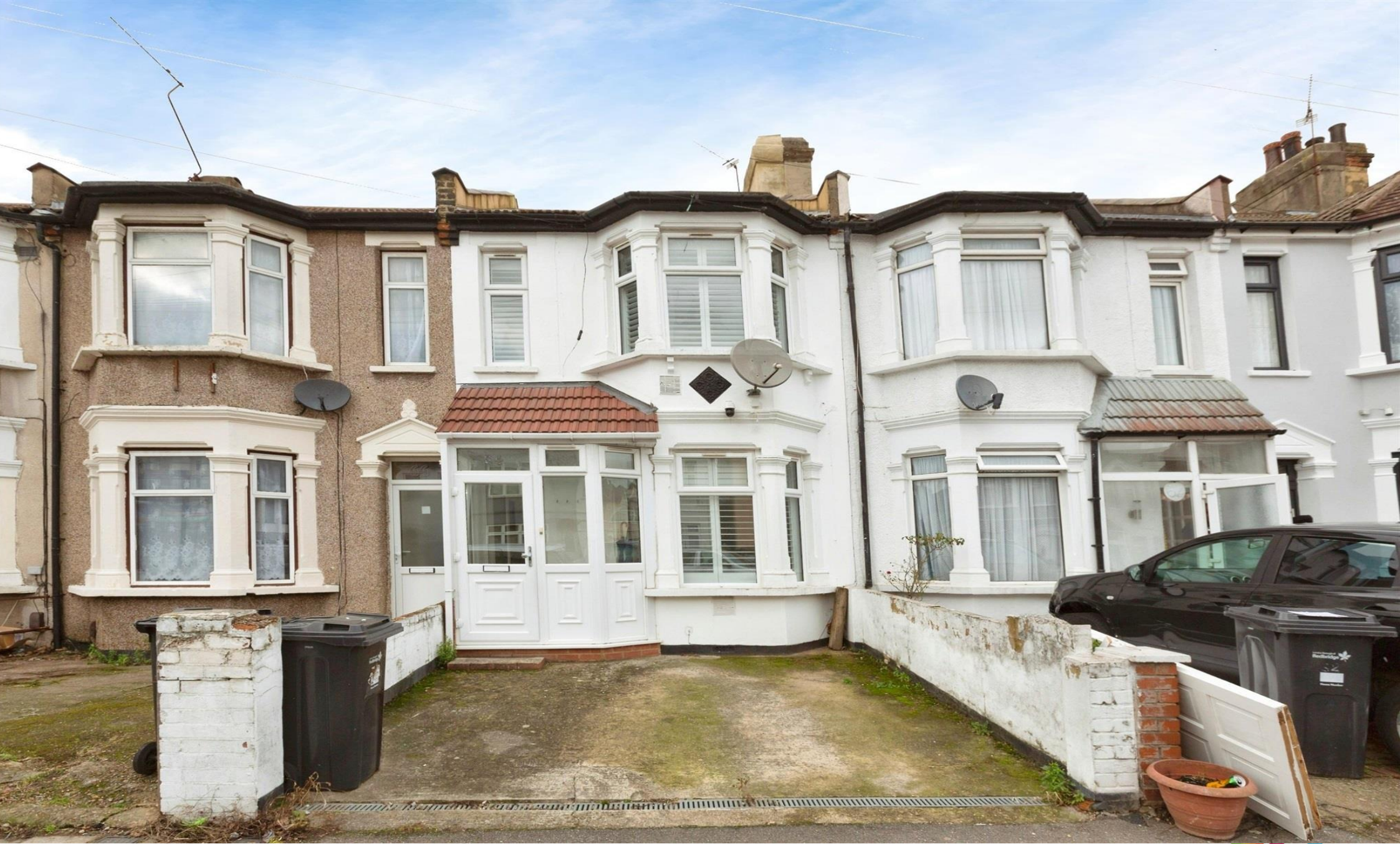
Norman Road, Ilford, IG1 2NG