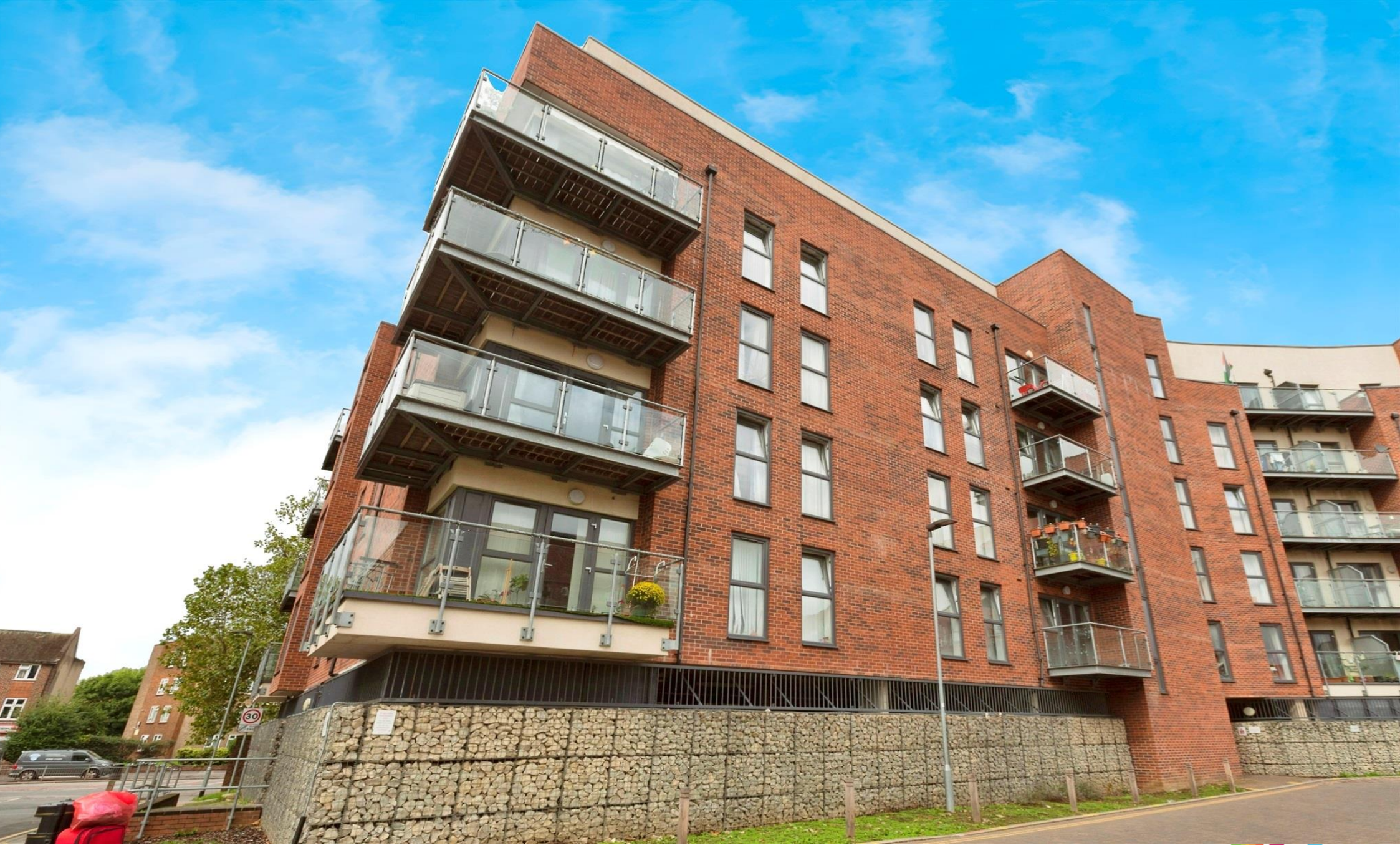
Brunel House, Chancellor Way, Dagenham, RM8 2GQ