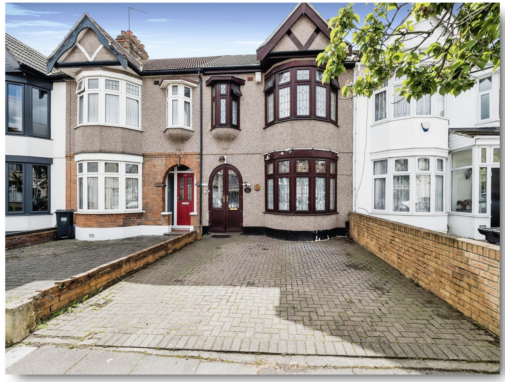
Ashburton Avenue, Ilford, IG3 9EN