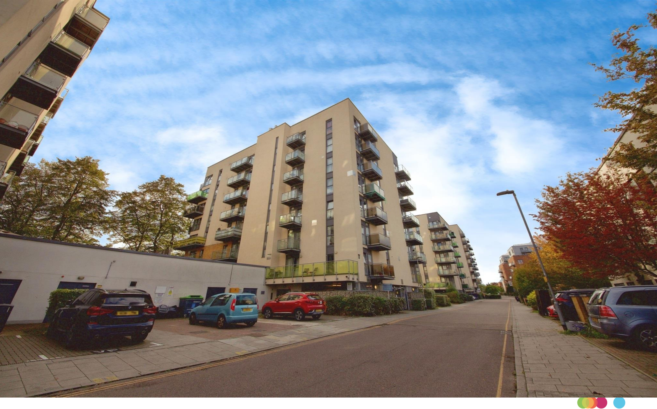
Pembroke House, Academy Way, Dagenham, RM8 2FE