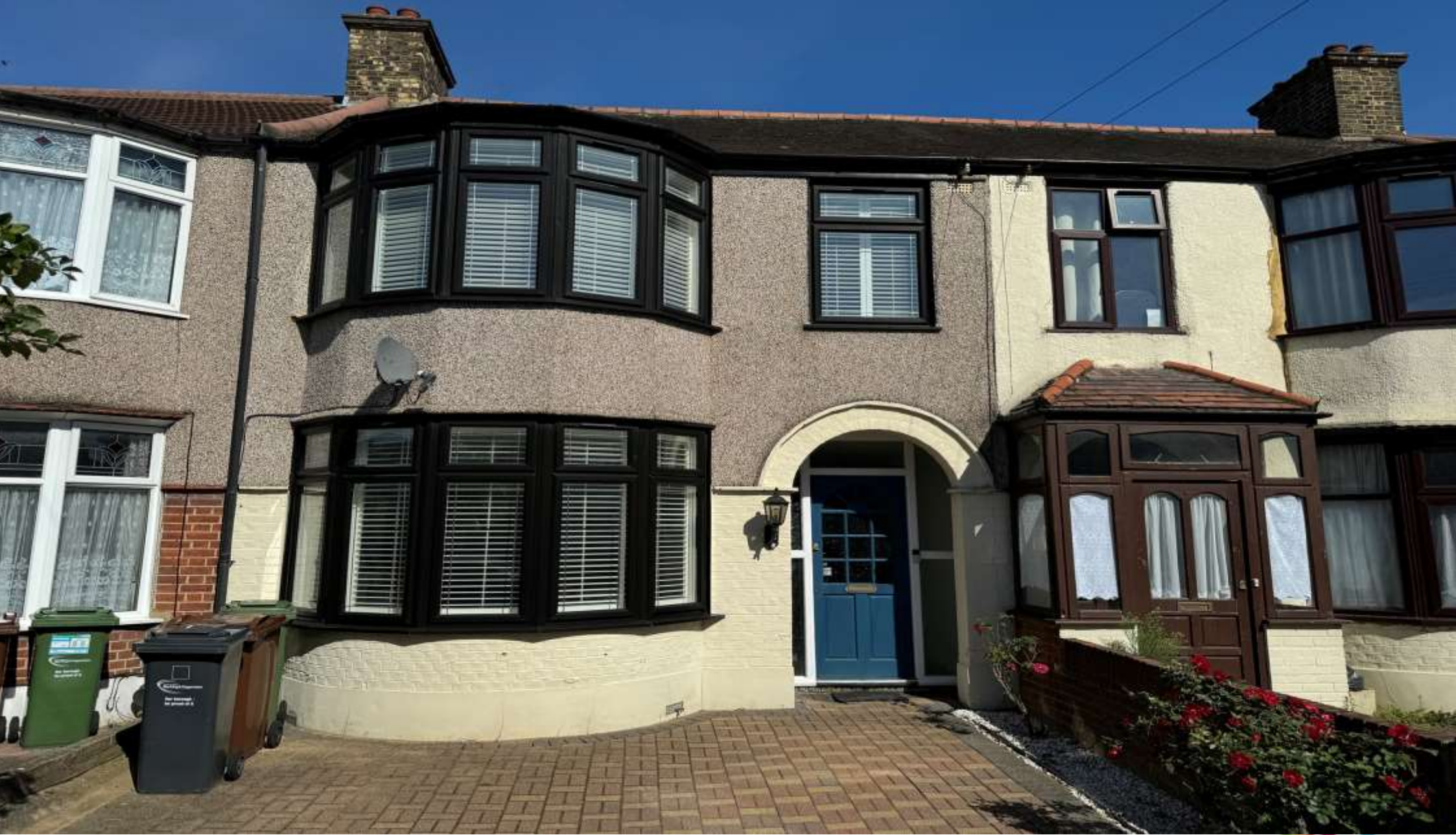
Shirley Gardens, Barking, IG11 9XB