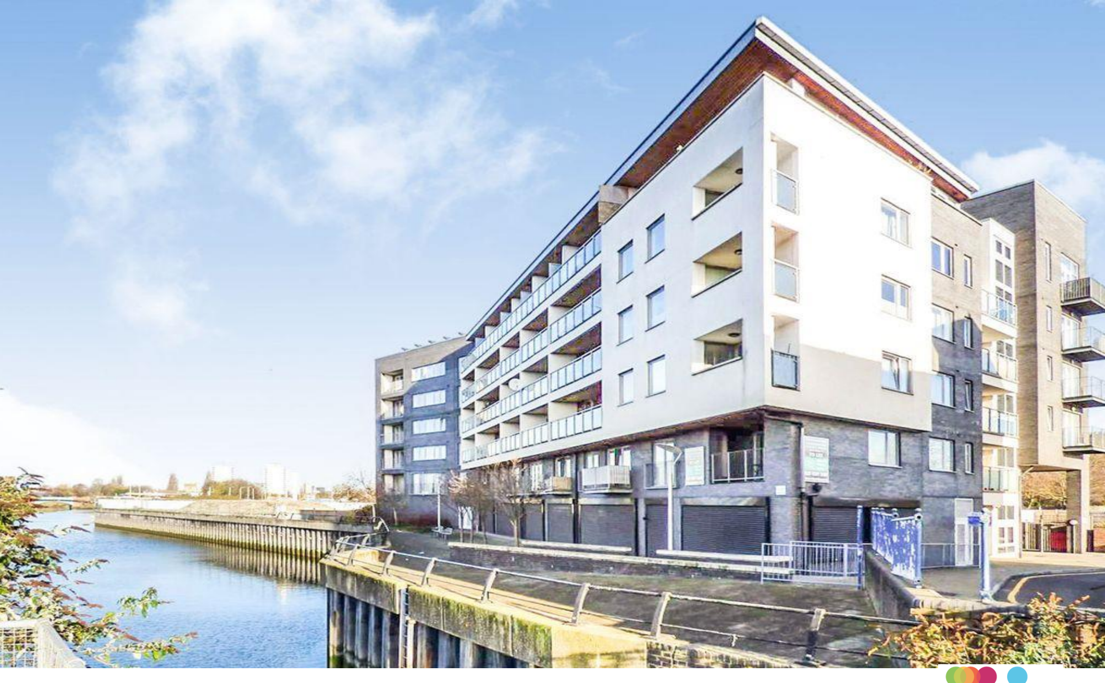
Benedicts Wharf, Highbridge Road, Barking, IG11 7BB