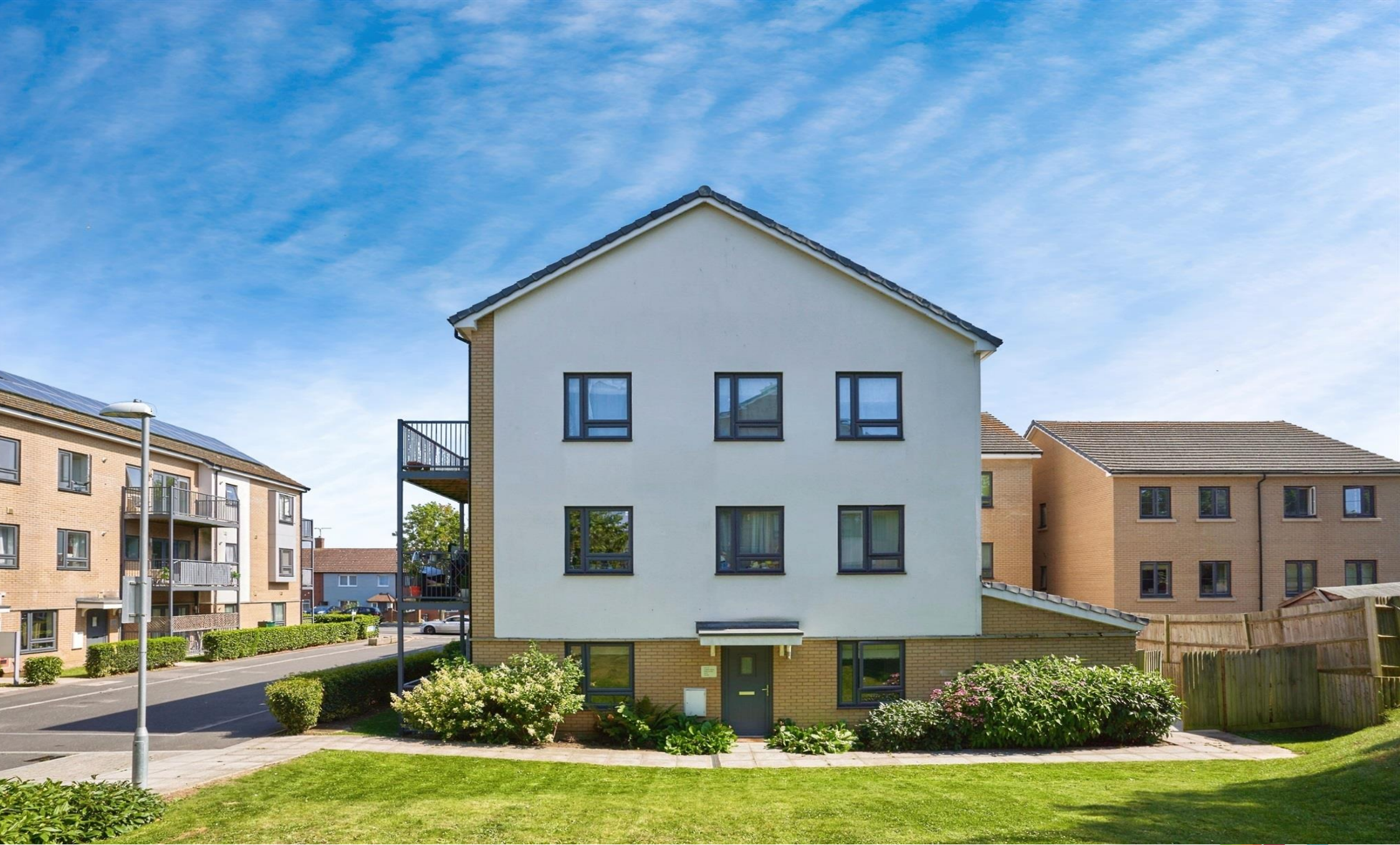
Albert House, Reservoir Way, Ilford, IG6 3FE