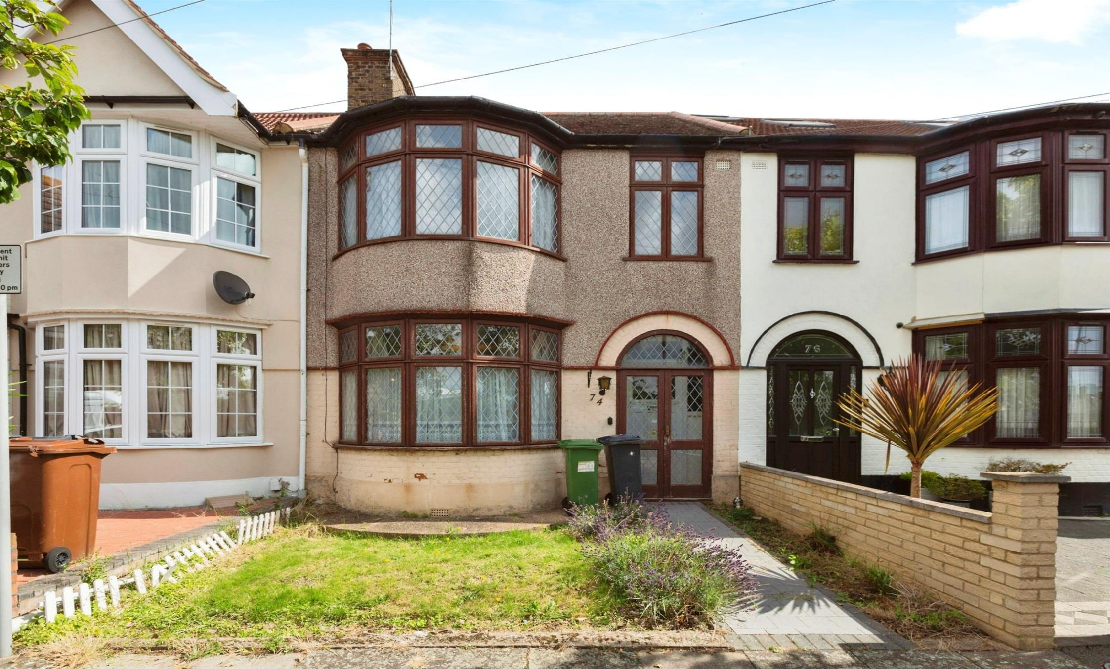
Hurstbourne Gardens, Barking, IG11 9UT