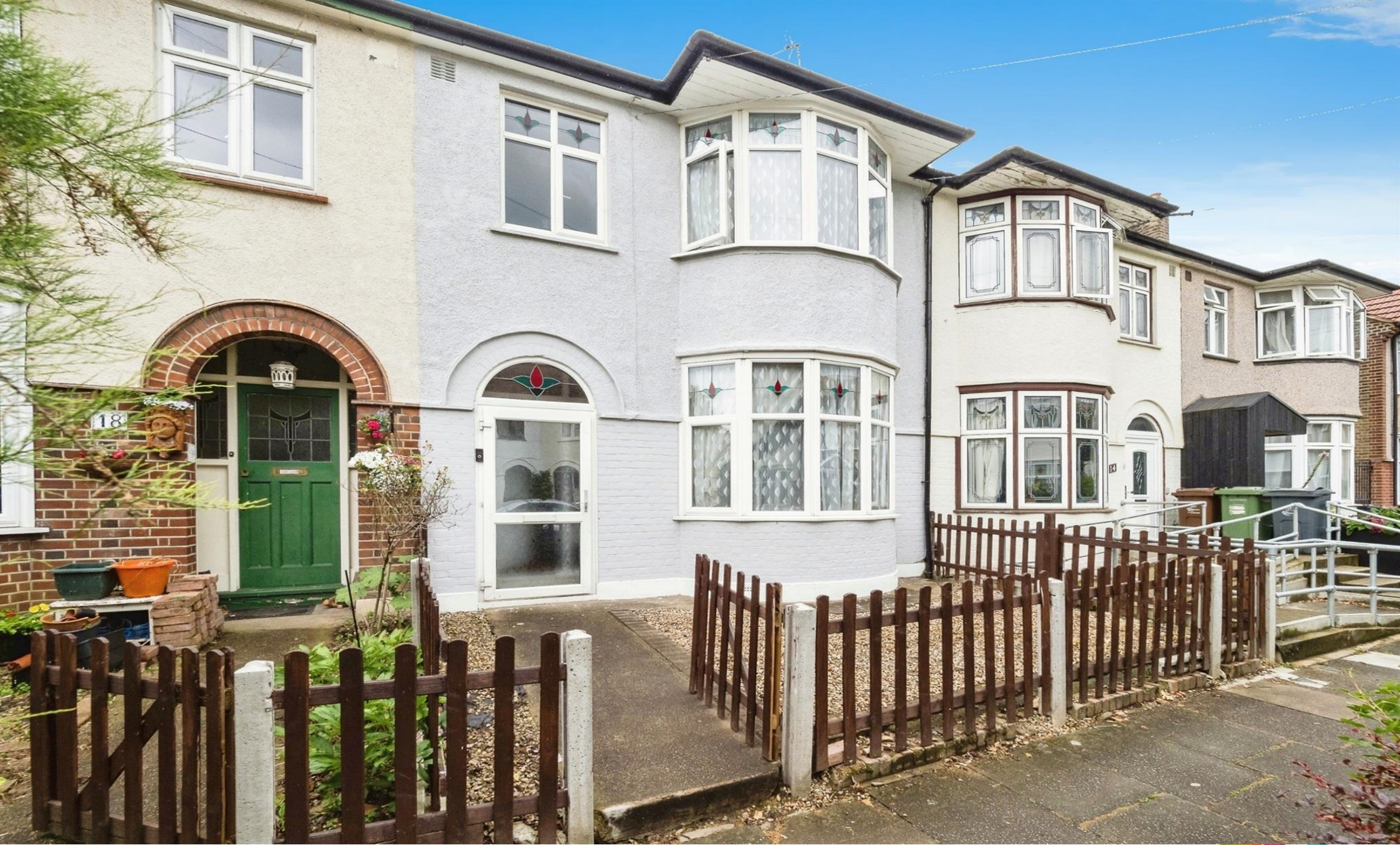
Sherwood Gardens, Barking, IG11 9TH