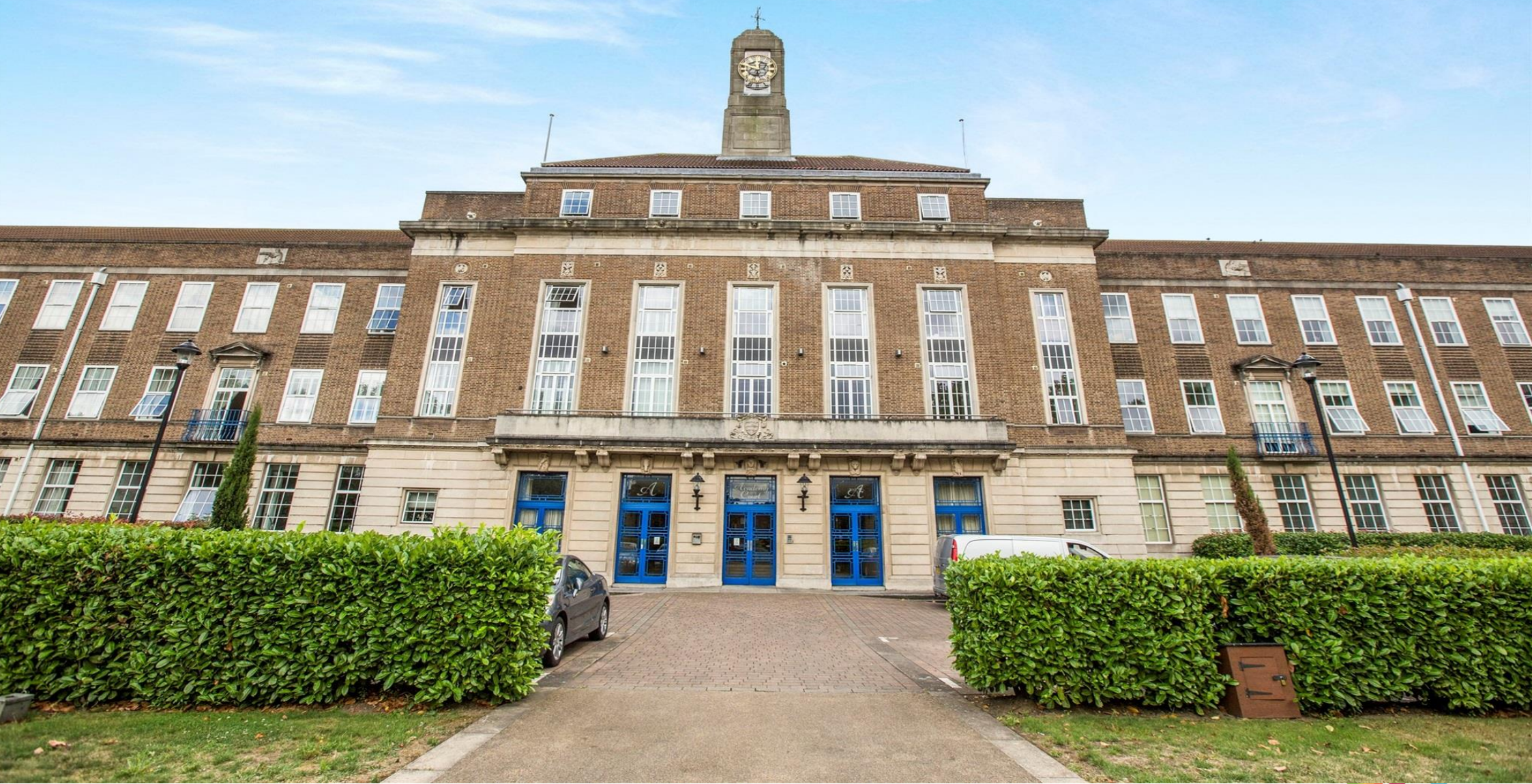
Academy Court, Longbridge Road, Dagenham, RM8 2AR