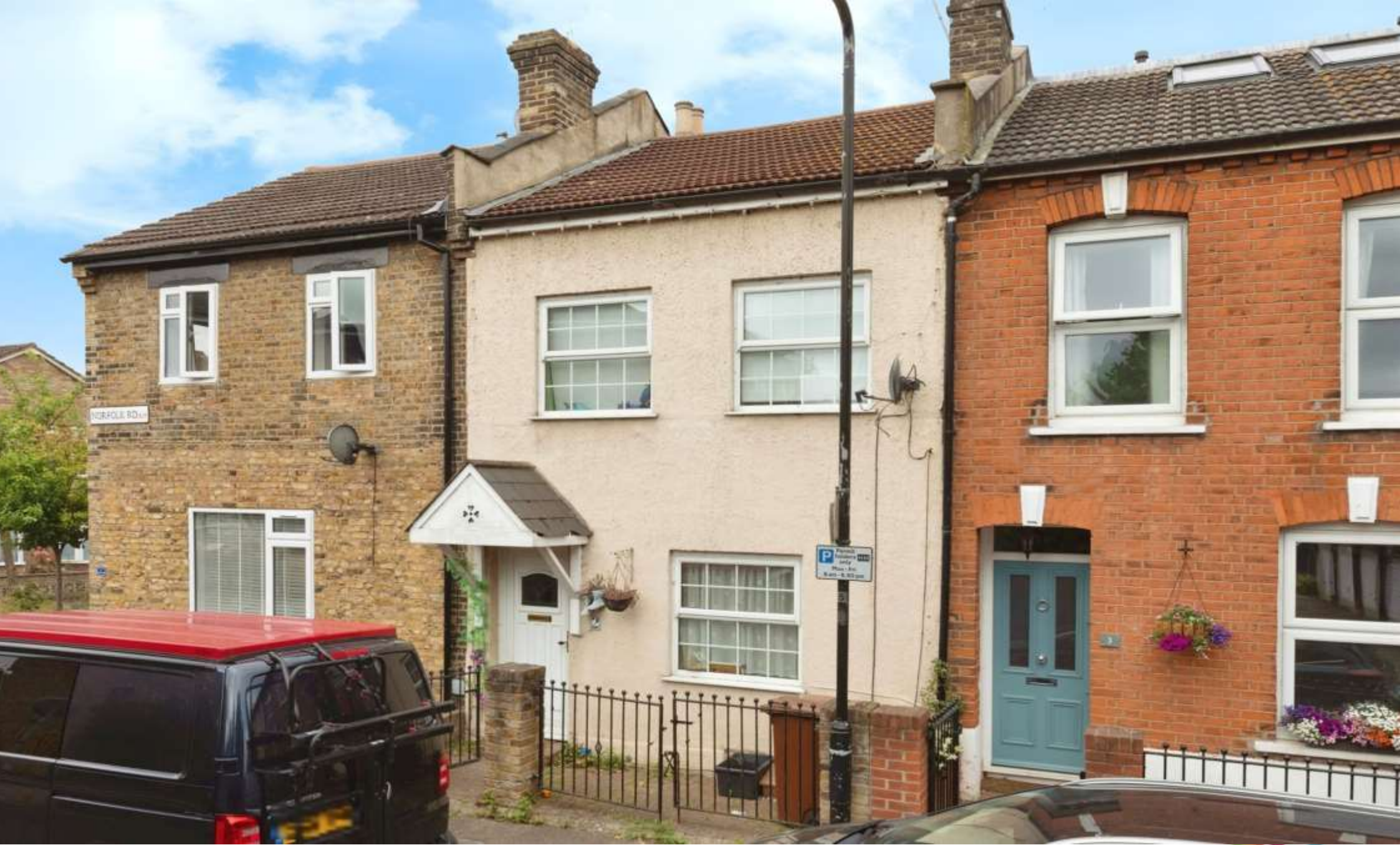
Norfolk Road, London, E17 5QS