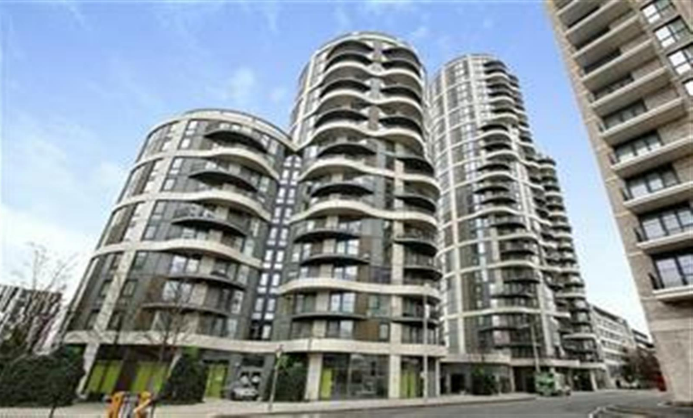
Oculus House, Cambridge Road, Barking, IG11 8SX