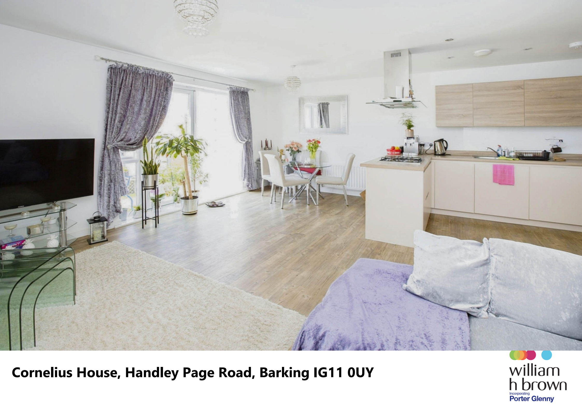
Cornelius House, Handley Page Road, Barking IG11 0UY