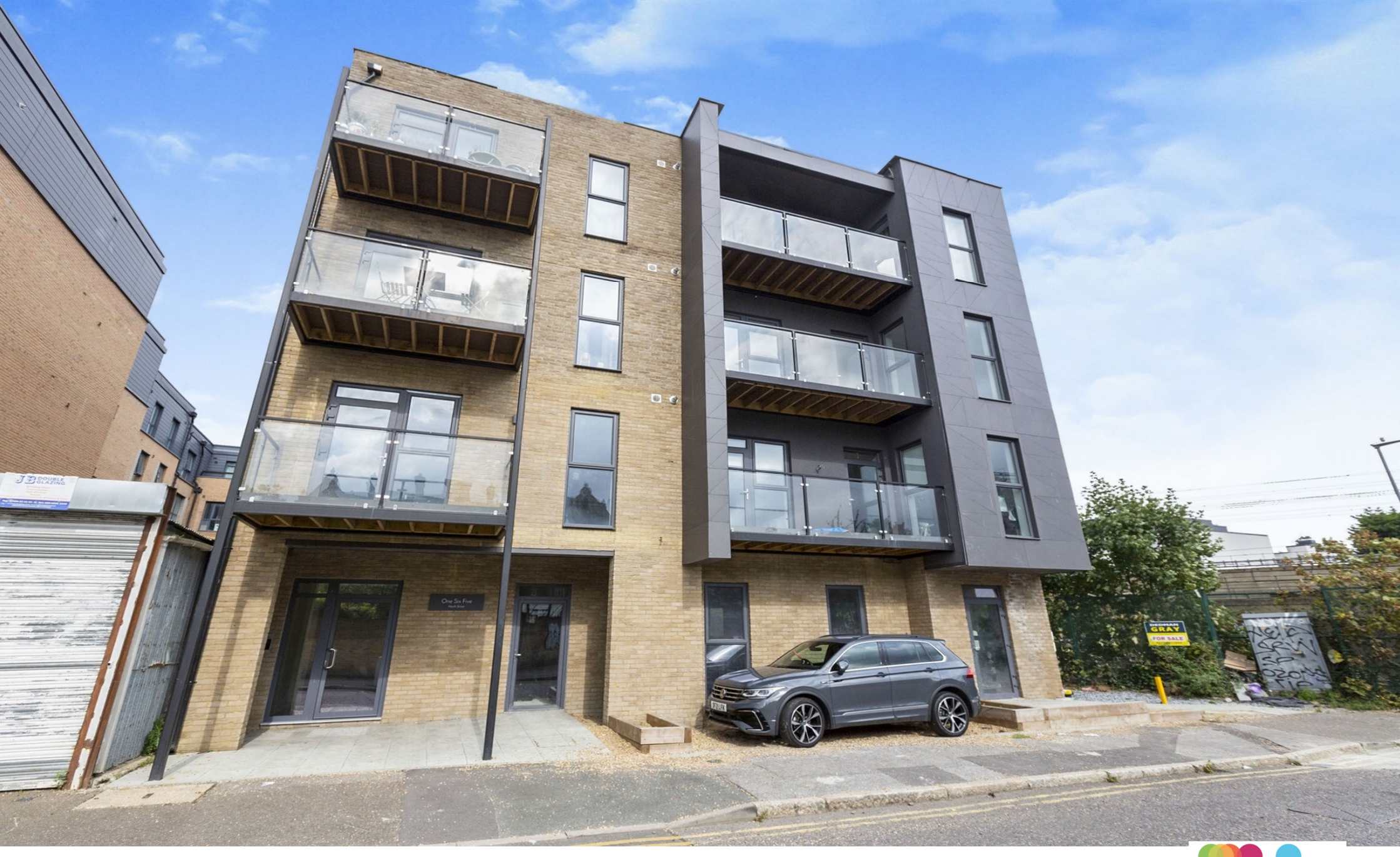
One Six Five North Street, Barking IG11 8LA