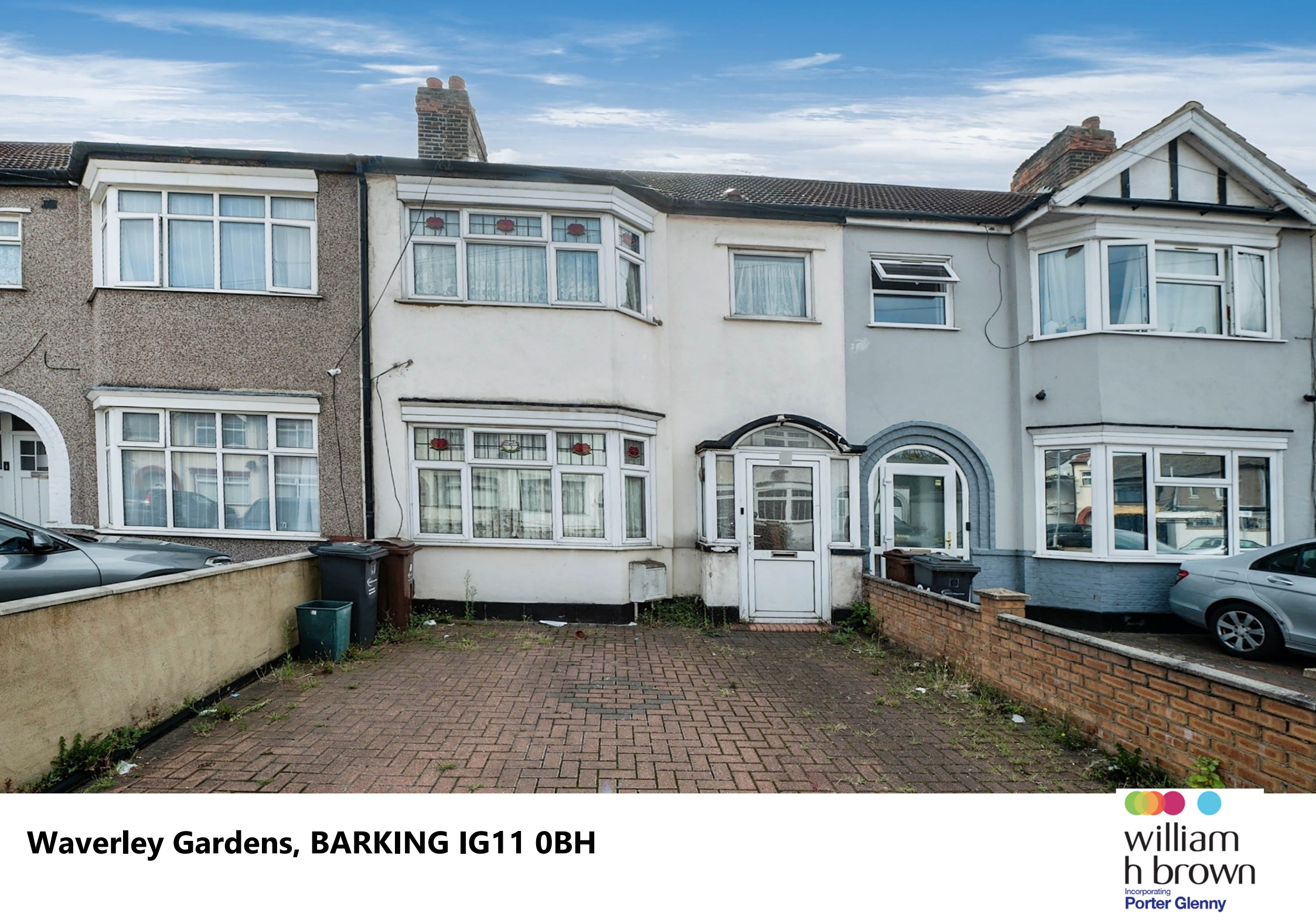
Waverley Gardens, BARKING IG11 0BH