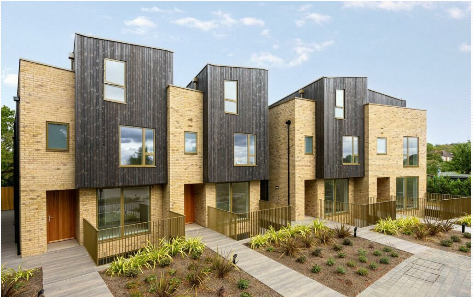
Coombe Lane, West Wimbledon, SW20 0RW