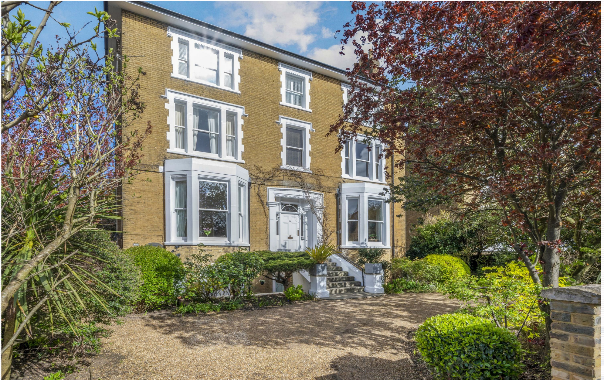
Ridgway, Wimbledon, SW19 4RA