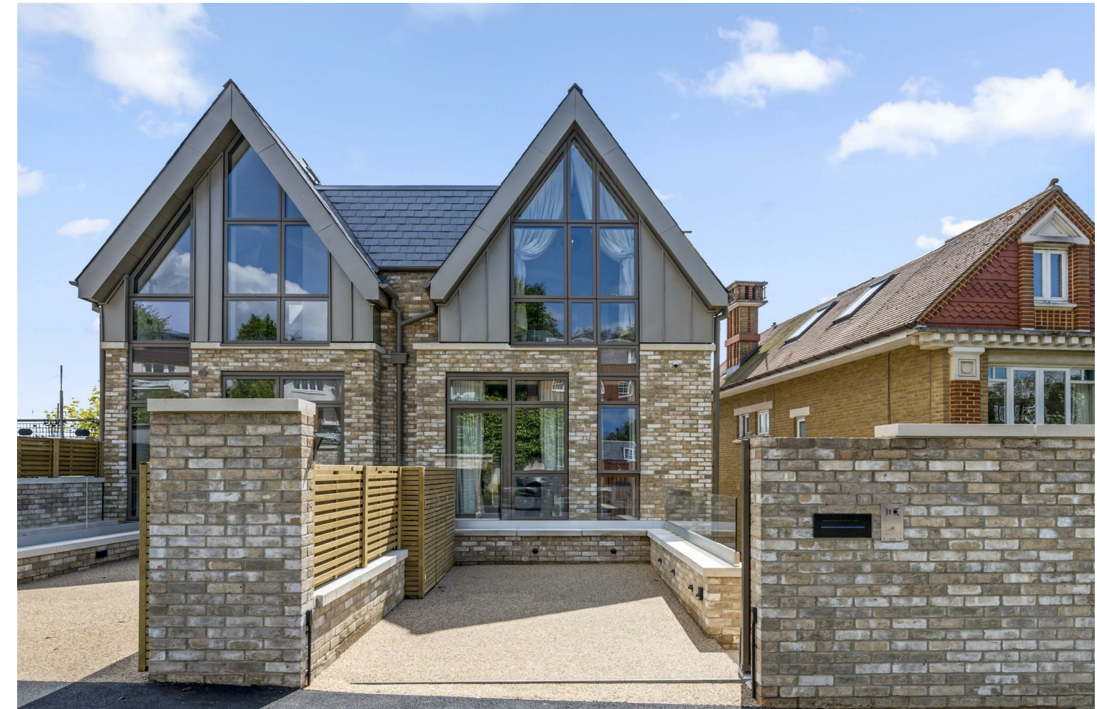
Cottenham Park Road, West Wimbledon, SW20 0SB

THIS FLOOR PLAN SHOULD BE USED AS A GENERAL OUTLINE FOR GUIDANCE ONLY AND DOES NOT CONSTITUTE IN WHOLE OR IN PART AN OFFER OR CONTRACT. ANY INTENDING PURCHASER OR LESSEE SHOULD SATISFY THEMSELVES BY INSPECTION, SEARCHES, ENQUIRIES AND FULL SURVEY AS TO THE CORRECTNESS OF EACH STATEMENT. ANY AREAS, MEASUREMENTS OR DISTANCES QUOTED ARE APPROXIMATE AND SHOULD NOT BE USED TO VALUE A PROPERTY OR BE THE BASIS OF ANY SALE OR LET.