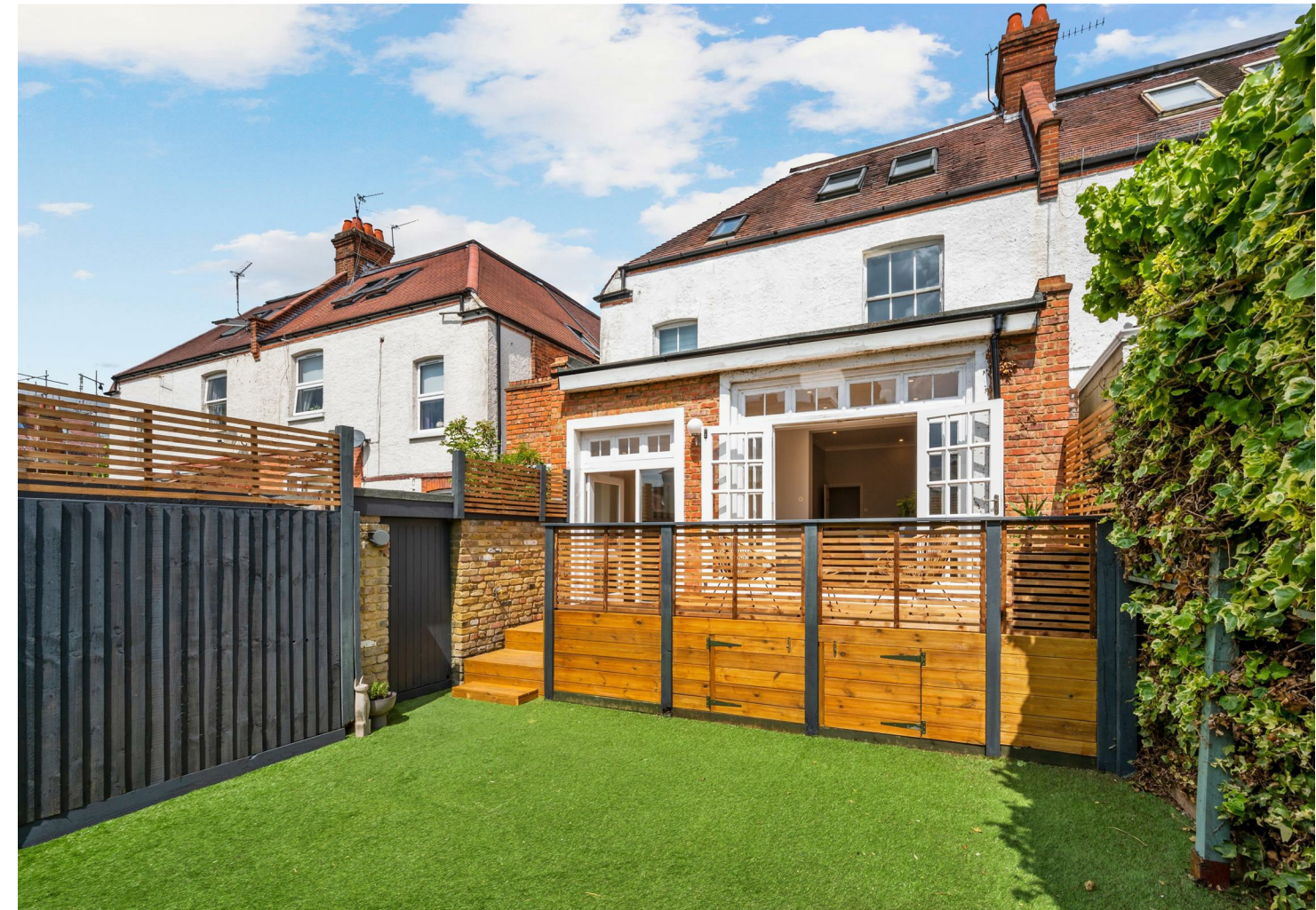
71b Melbury Gardens, West Wimbledon, SW20 0DL

This plan is for guidance only. Drawn in accordance with RICS guidelines. Not drawn to scale unless stated. Windows and door openings are approximate. Whilst every care is taken in the preparation of this plan, please check all dimensions, shapes and compass bearings before making any decisions reliant upon them.