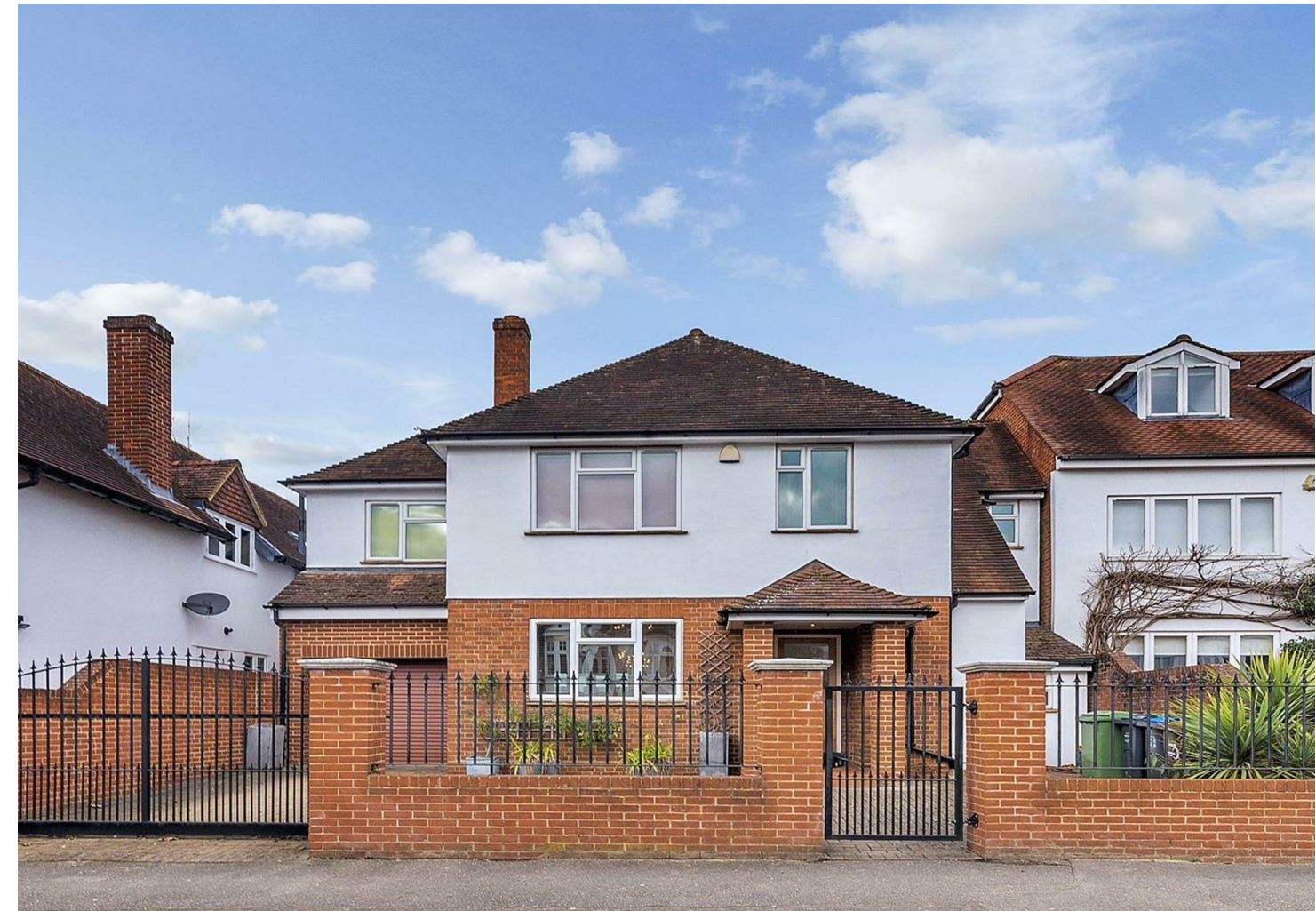
18 Melbury Gardens, West Wimbledon, SW20 0DJ

This plan is for guidance only. Drawn in accordance with RICS guidelines. Not drawn to scale unless stated. Windows and door openings are approximate. Whilst every care is taken in the preparation of this plan, please check all dimensions, shapes and compass bearings before making any decisions reliant upon them.