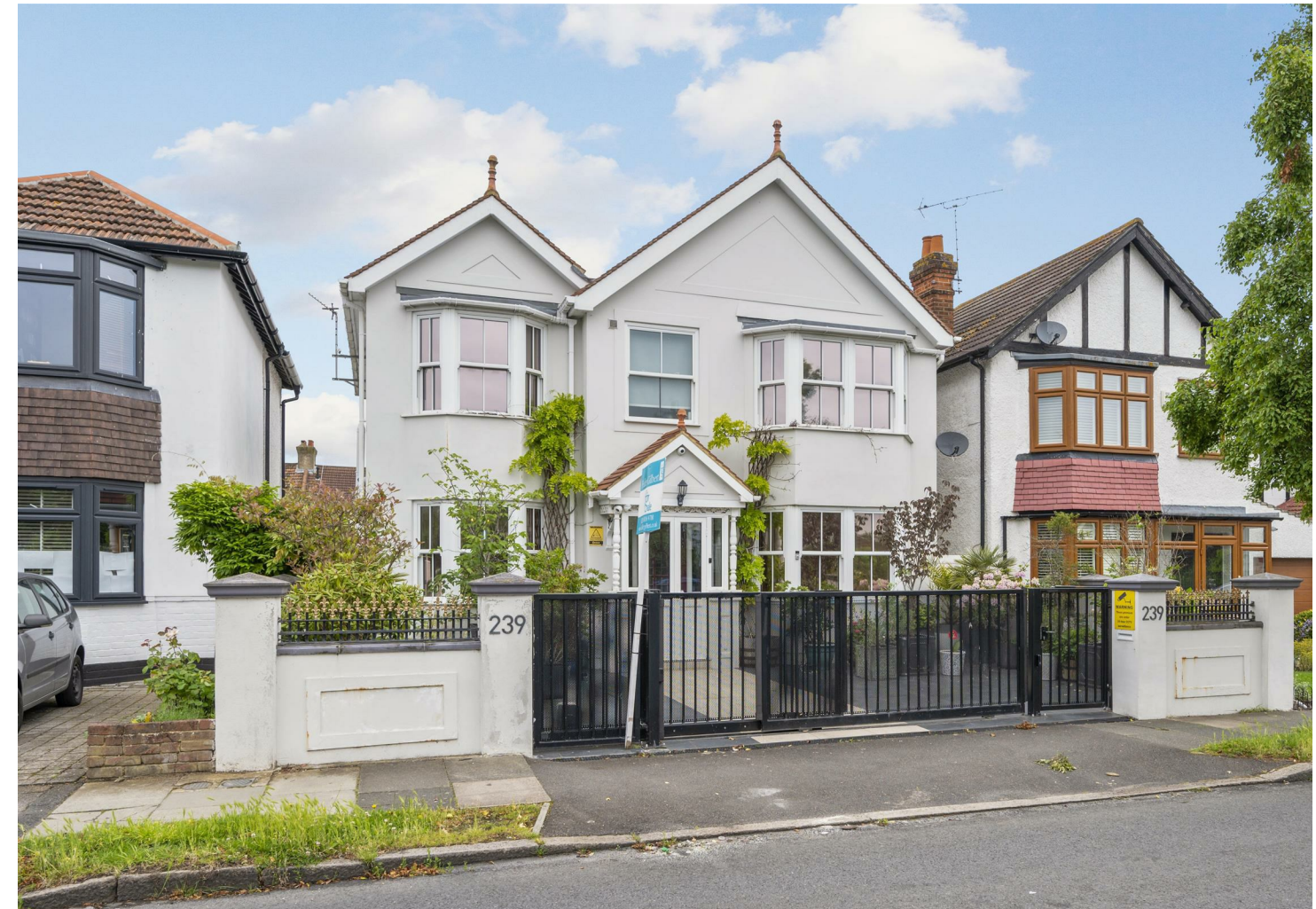
239 West Barnes Lane, New Malden, KT3 6JD

THIS FLOOR PLAN SHOULD BE USED AS A GENERAL OUTLINE FOR GUIDANCE ONLY AND DOES NOT CONSTITUTE IN WHOLE OR IN PART AN OFFER OR CONTRACT. ANY INTENDING PURCHASER OR LESSEE SHOULD SATISFY THEMSELVES BY INSPECTION, SEARCHES, ENQUIRIES AND FULL SURVEY AS TO THE CORRECTNESS OF EACH STATEMENT. ANY AREAS, MEASUREMENTS OR DISTANCES QUOTED ARE APPROXIMATE AND SHOULD NOT BE USED TO VALUE A PROPERTY OR BE THE BASIS OF ANY SALE OR LET.