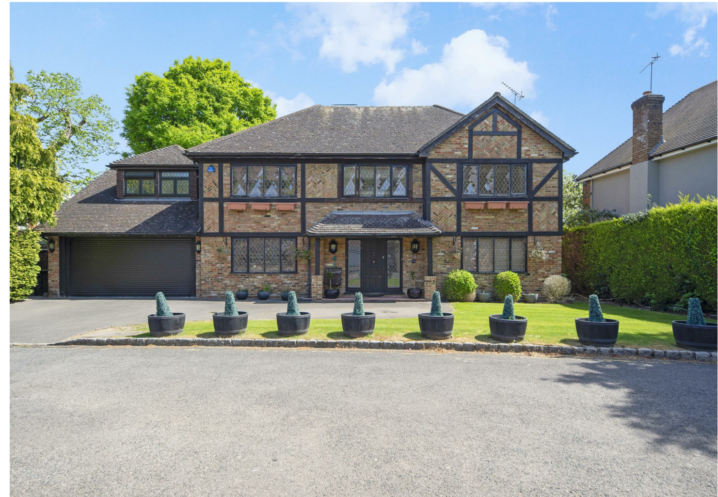
5 Greenoak Way, Wimbledon Village, SW19 5EN