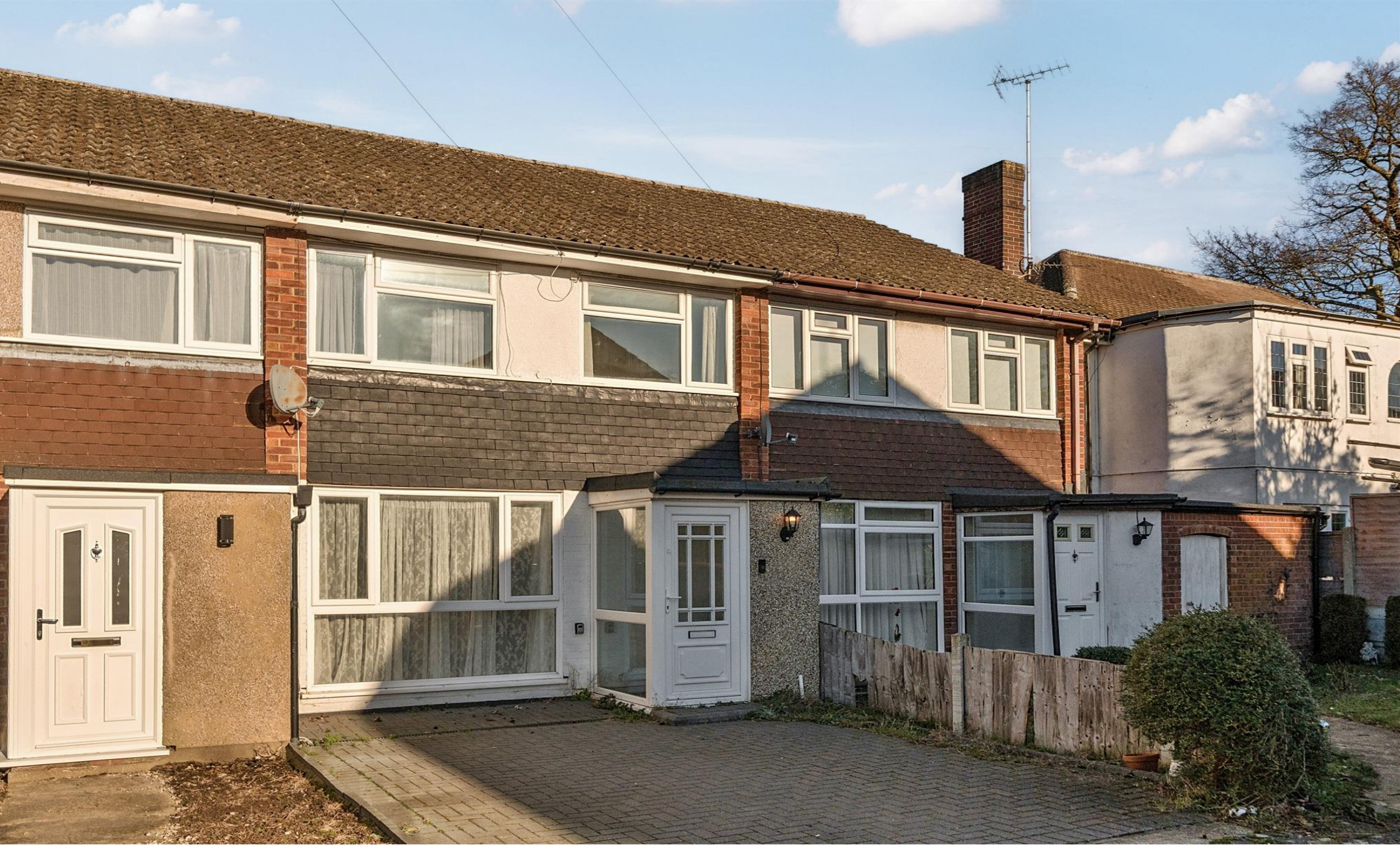
Acorn Close, Enfield, EN2 8LX