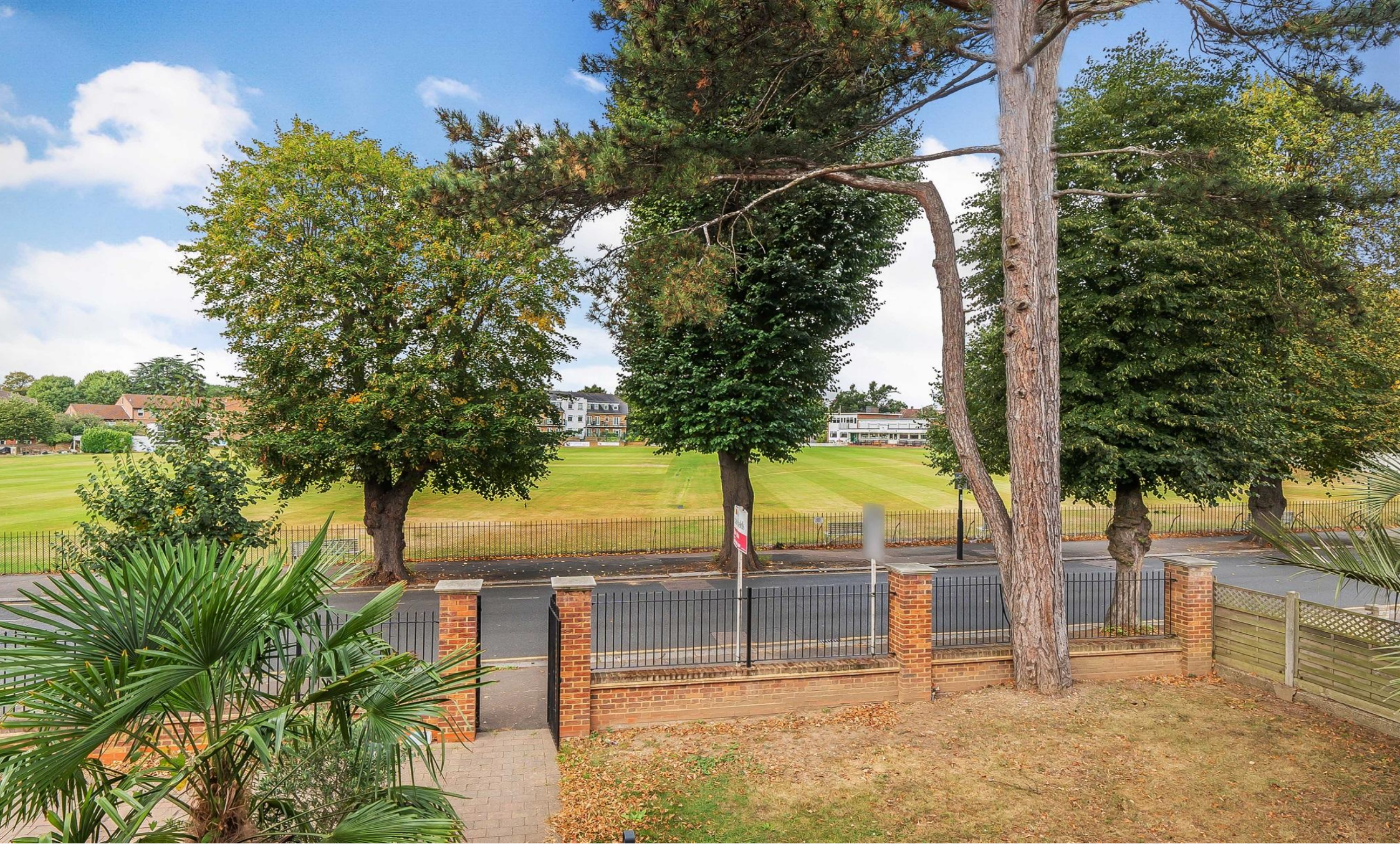
Wellington House, Wellington Road, Enfield, EN1 2PB