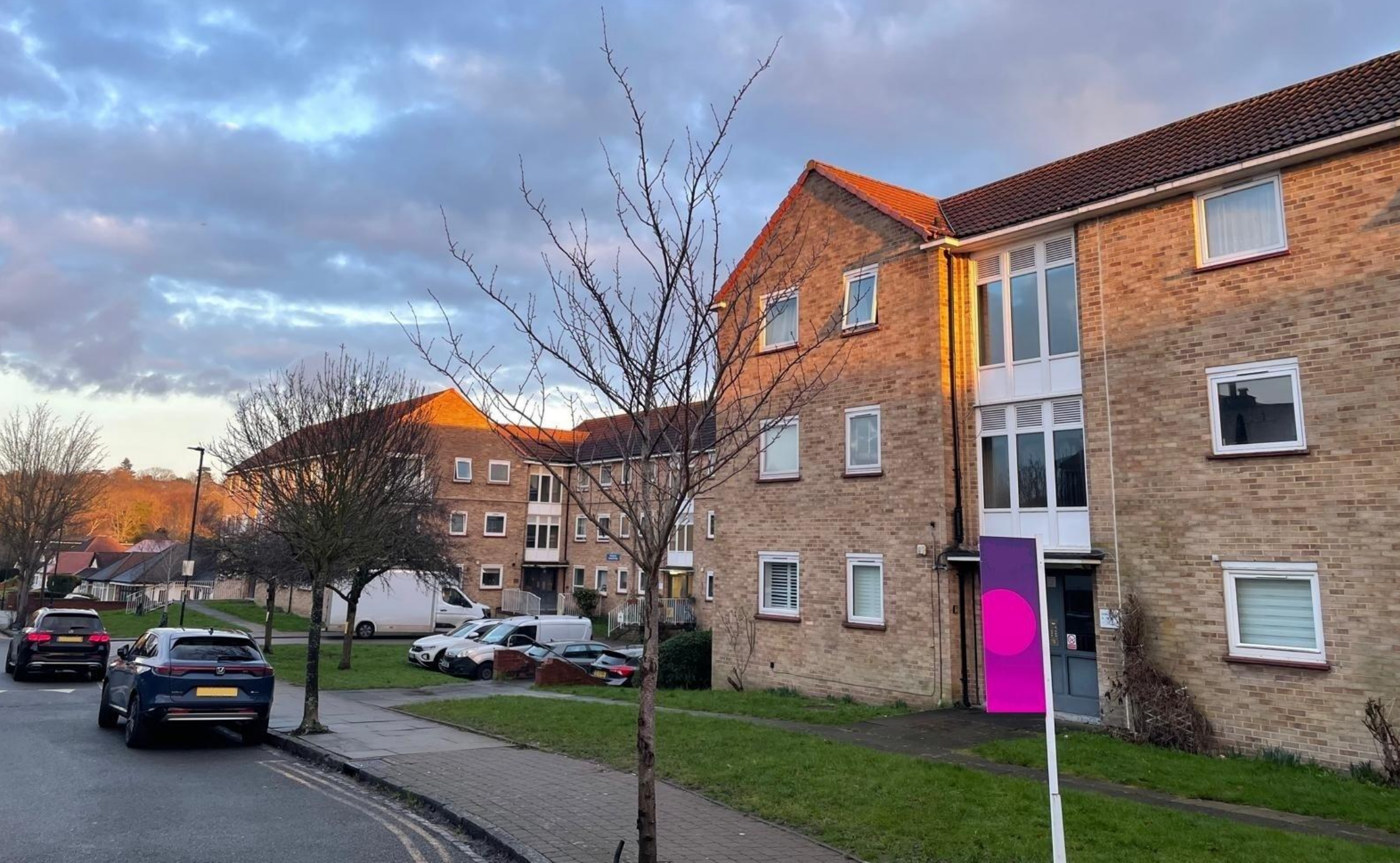
Links Side, Enfield, EN2 7QT