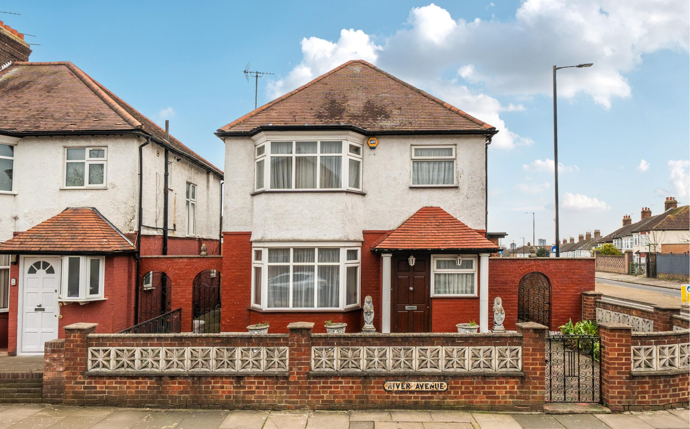
River Avenue, London, N13 5RP