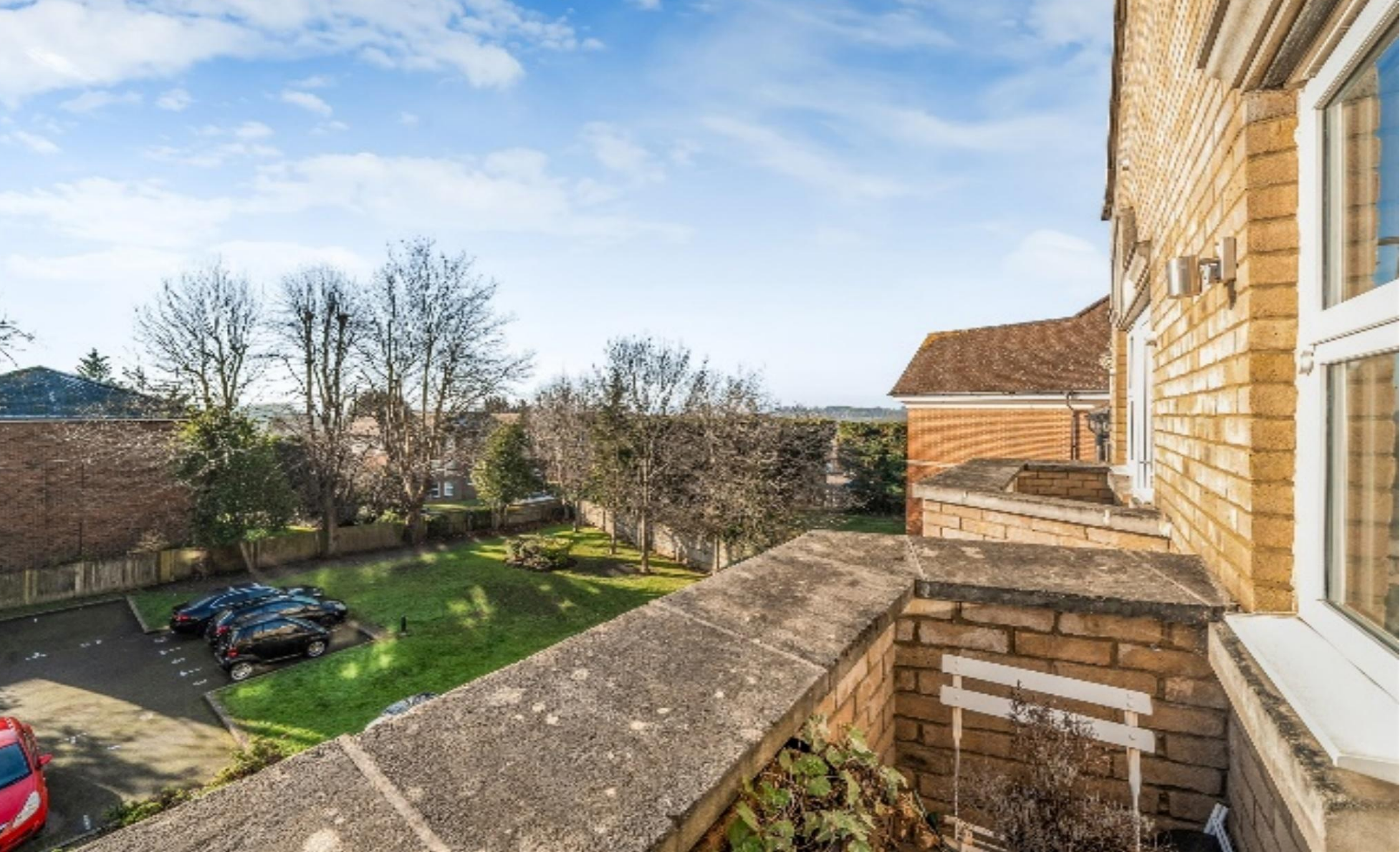
Salmons Brook House, Windmill Hill, Enfield, EN2 7AZ