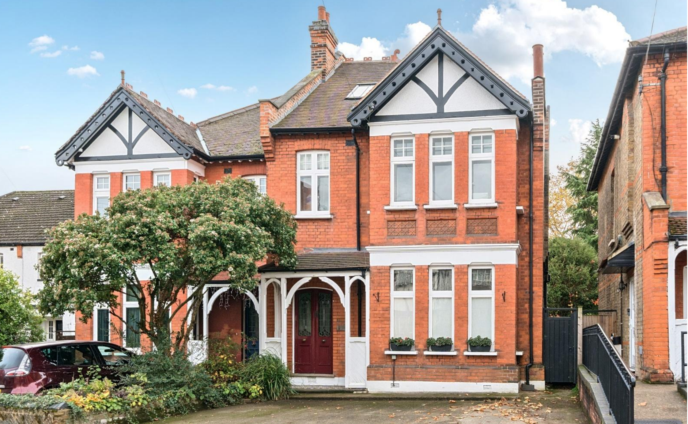
Cecil Road, Enfield, EN2 6TJ