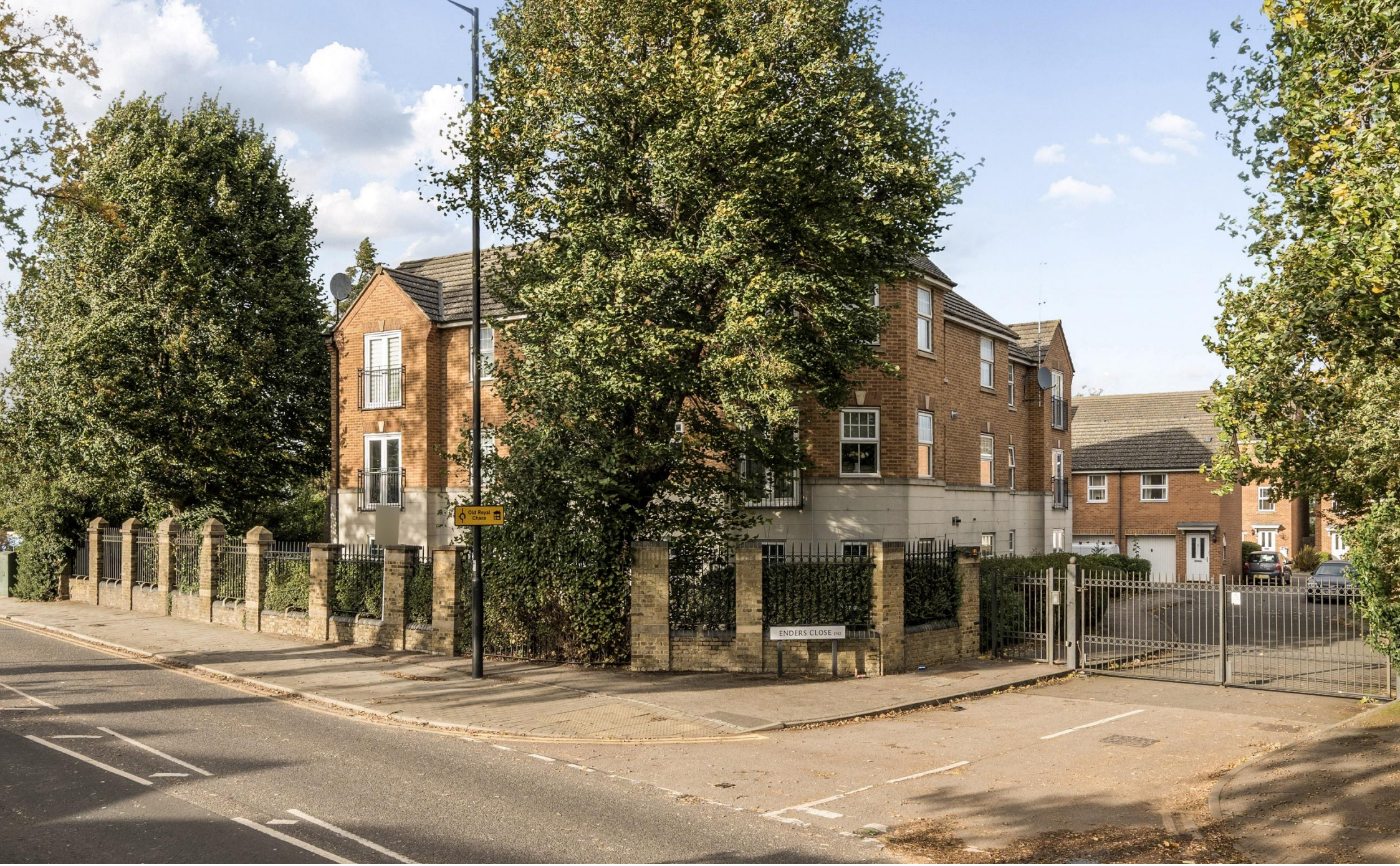
Enders Close, Enfield, EN2 8FJ