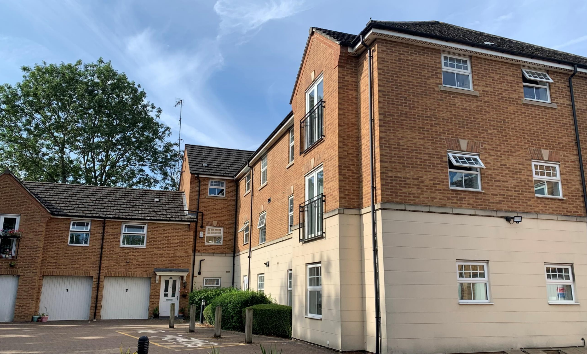
Weller Mews, Enfield, EN2 8FG