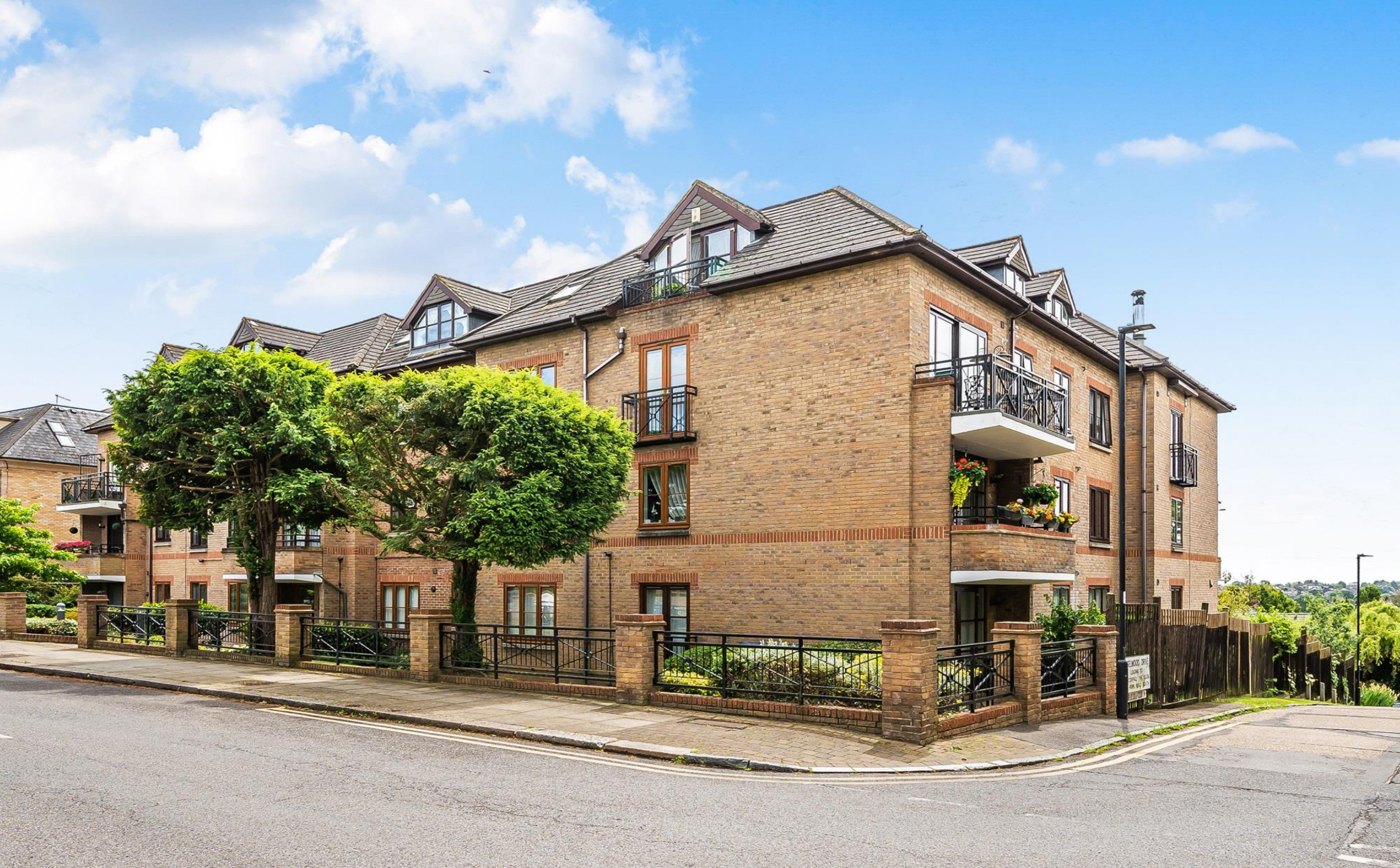
Claremont Heights, Crescent Road, Enfield, EN2 7RY