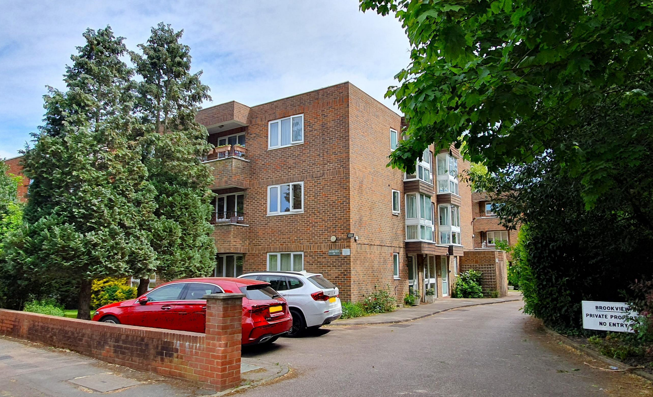
Brookview Court, Village Road, Enfield, EN1 2HE