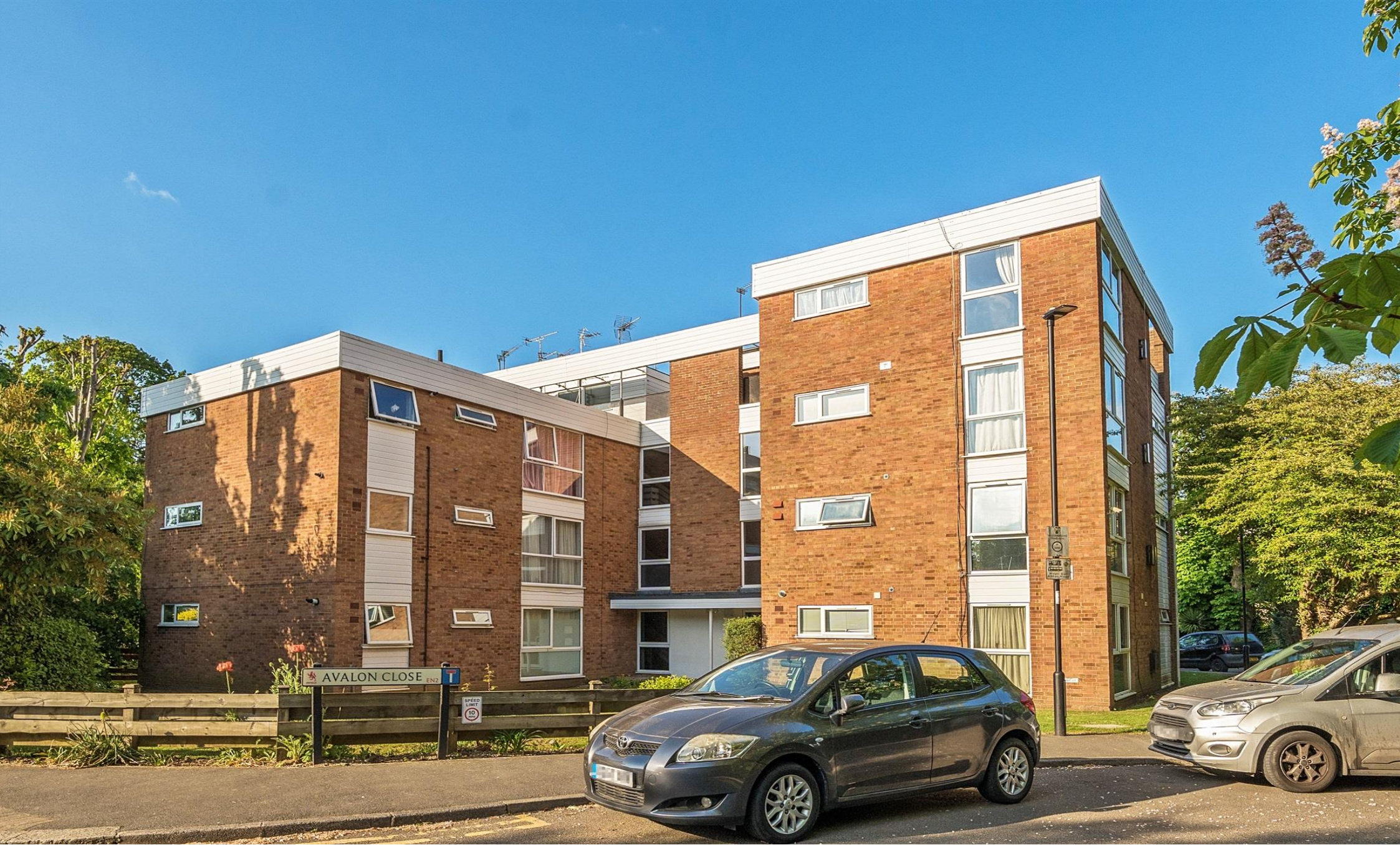
Avalon Close, Enfield, EN2 8LP