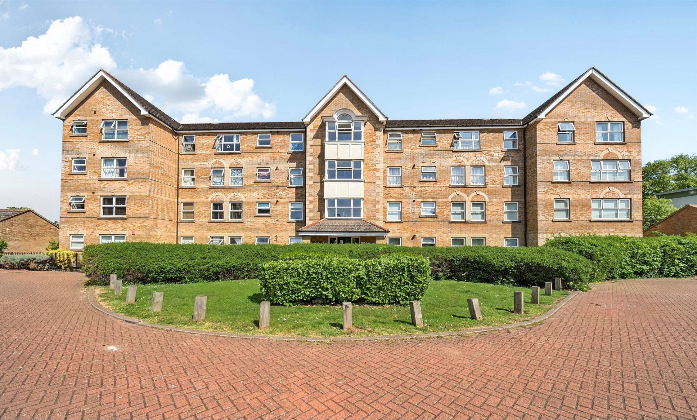
Cobham Close, Enfield, EN1 3SU