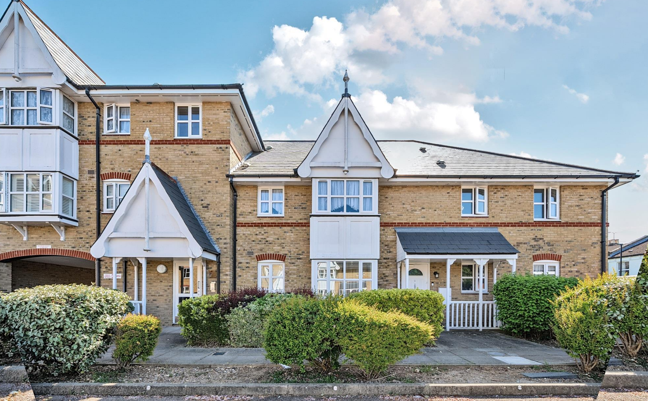
Shelly Lodge, Gordon Road, Enfield, EN2 0PL