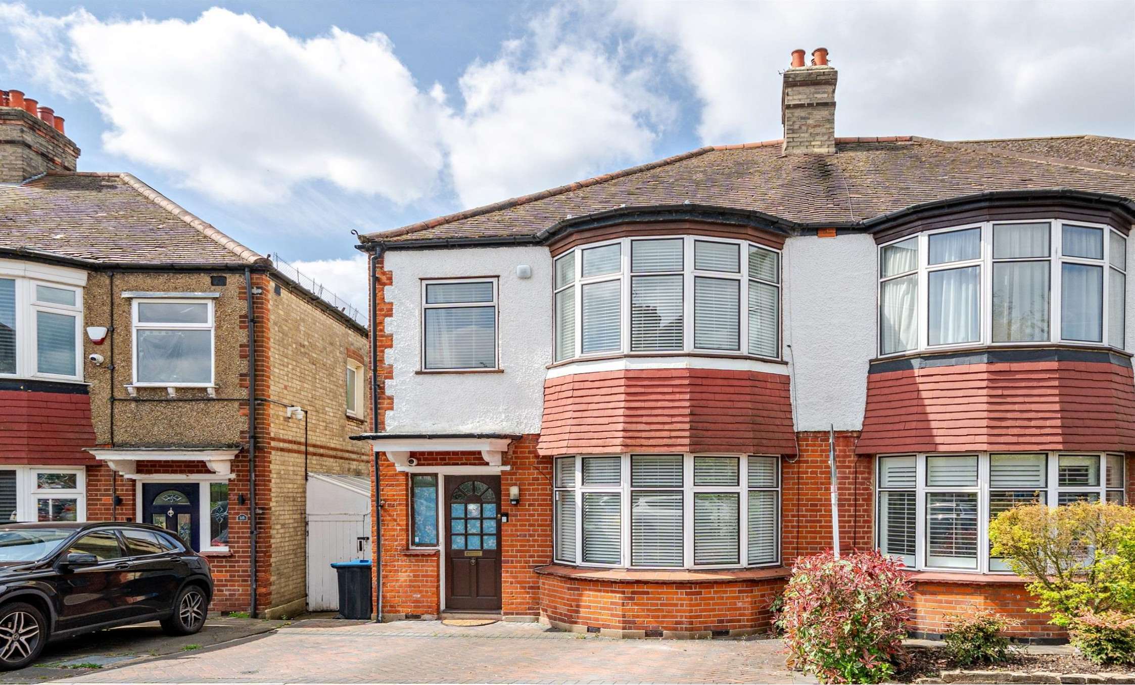
Ridge Crest, Enfield, EN2 8JX