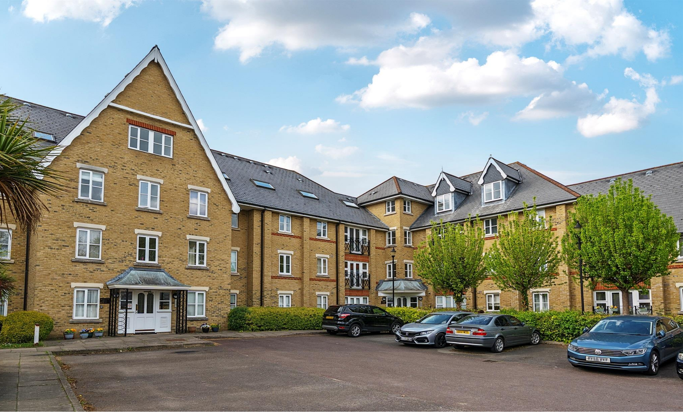
Whitakers Lodge, Gater Drive, Enfield, EN2 0JP