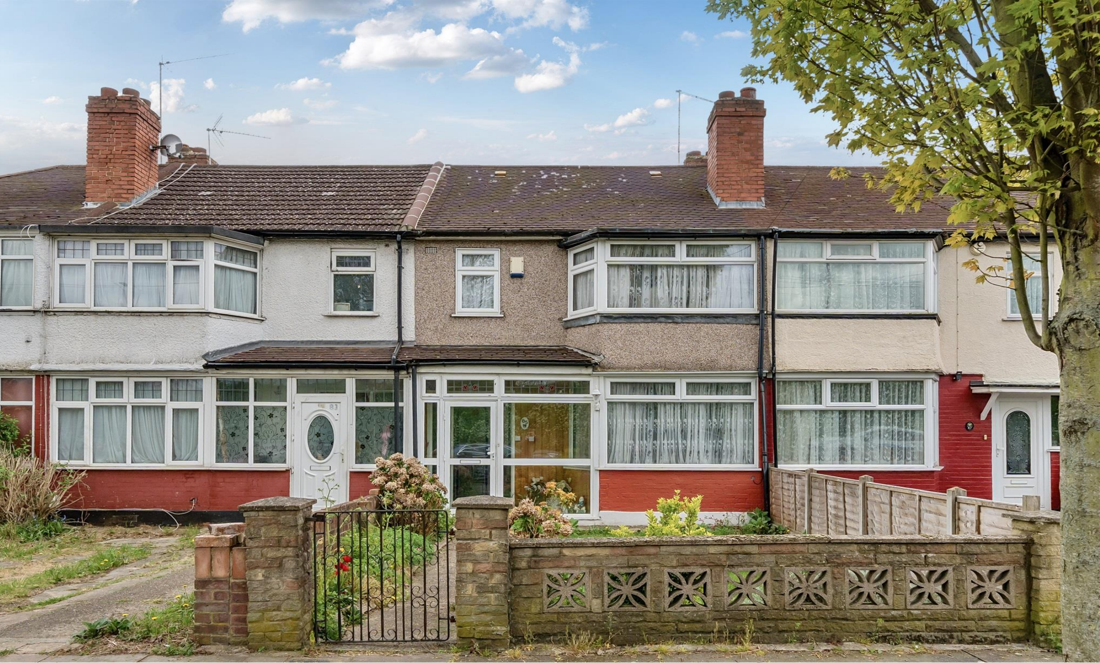
Dimsdale Drive, Enfield, EN1 1HD