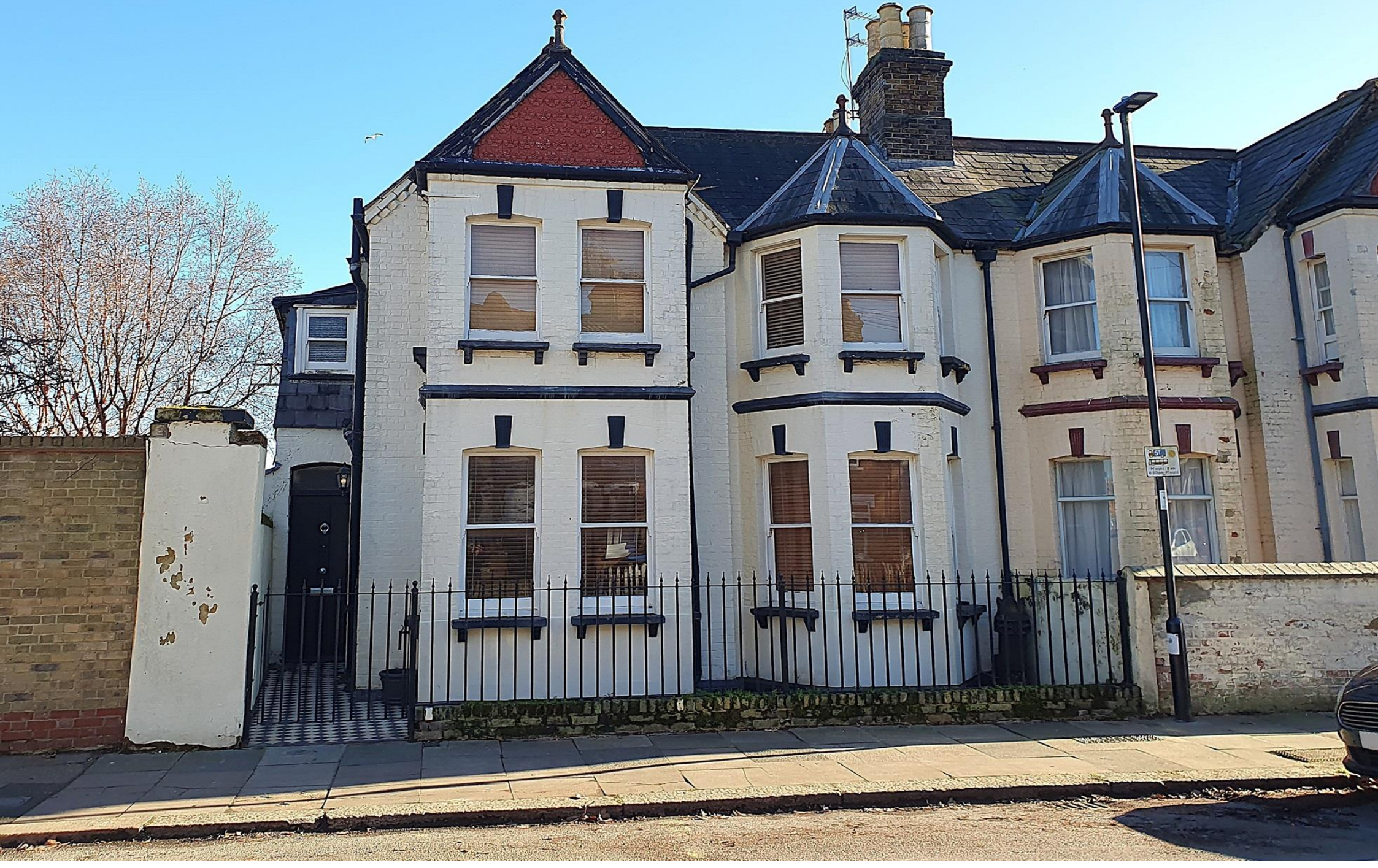
Chase Side Crescent, Enfield, EN2 0JA