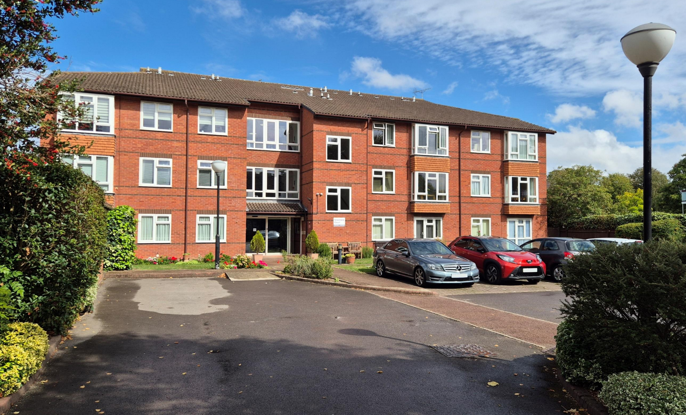
Grasmere Court, Village Road, Enfield, EN1 2DJ