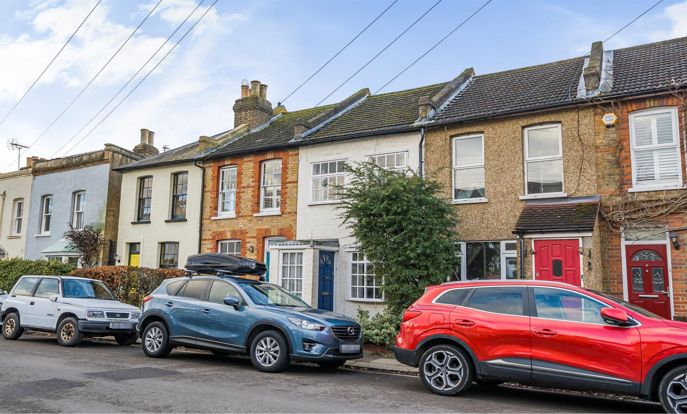
Goat Lane, Enfield, EN1 4UB